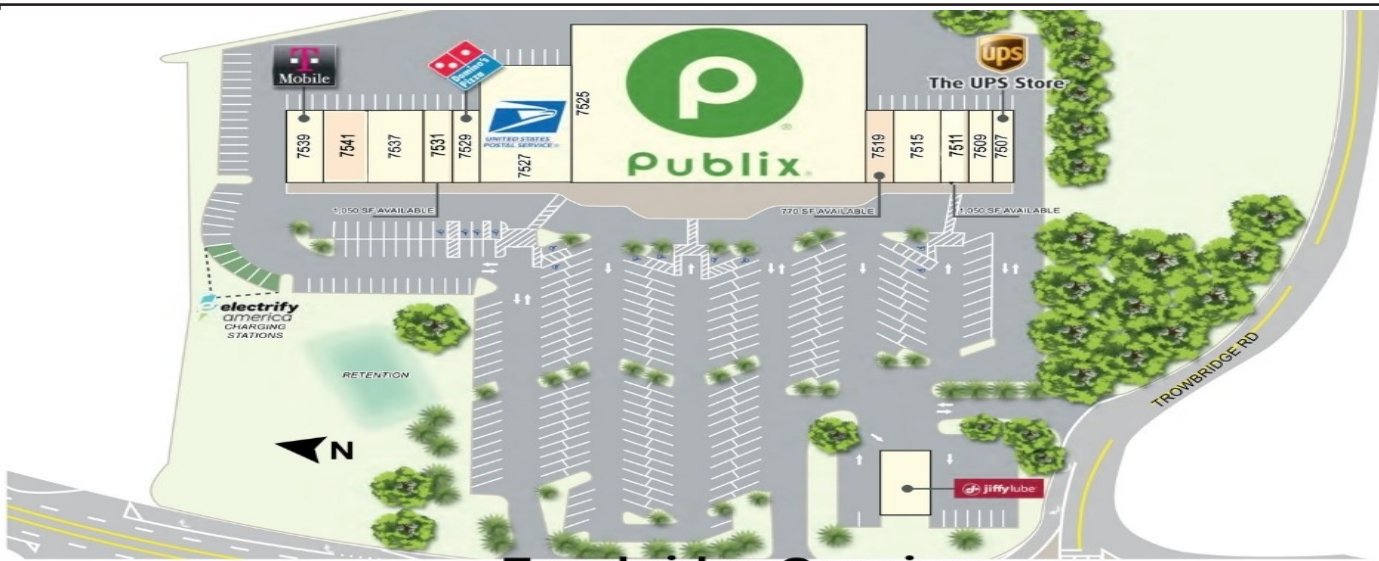
Trowbridge Crossing 7507-7535 Roswell Road Atlanta, GA 30350

7507-7535 Roswell Road Atlanta, GA 30350