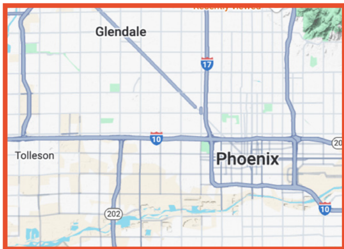
7020, 7024 & 7028 W. Van Buren, Phoenix, AZ 85043