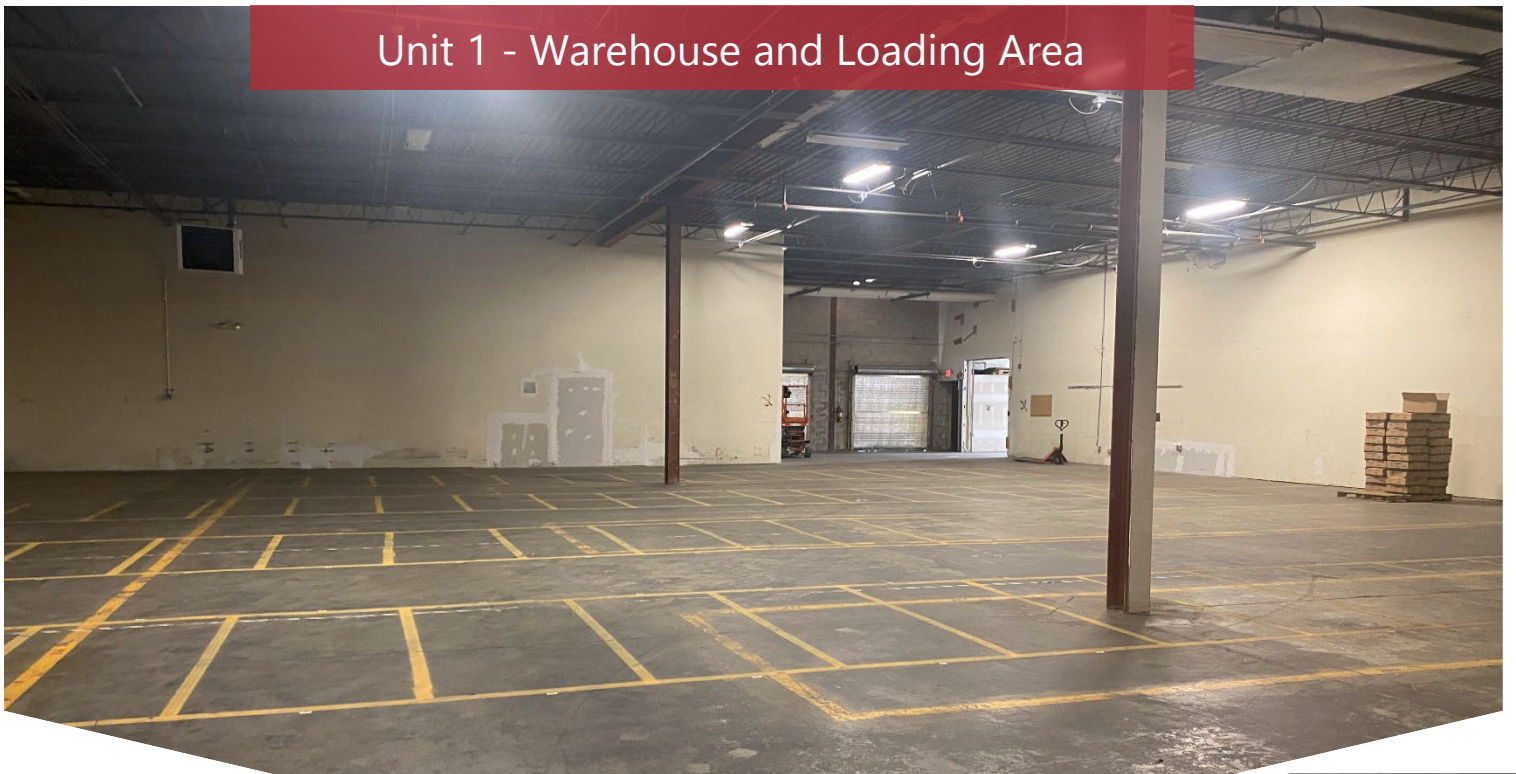
Unit 1 - Warehouse and Loading Area