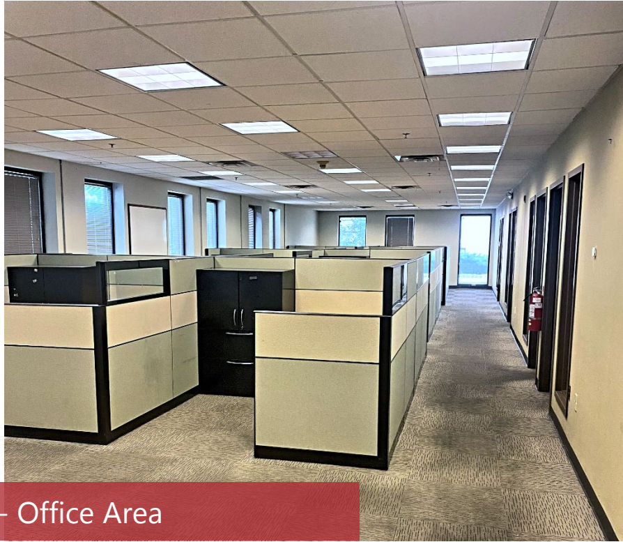
Unit 1 - Office Area