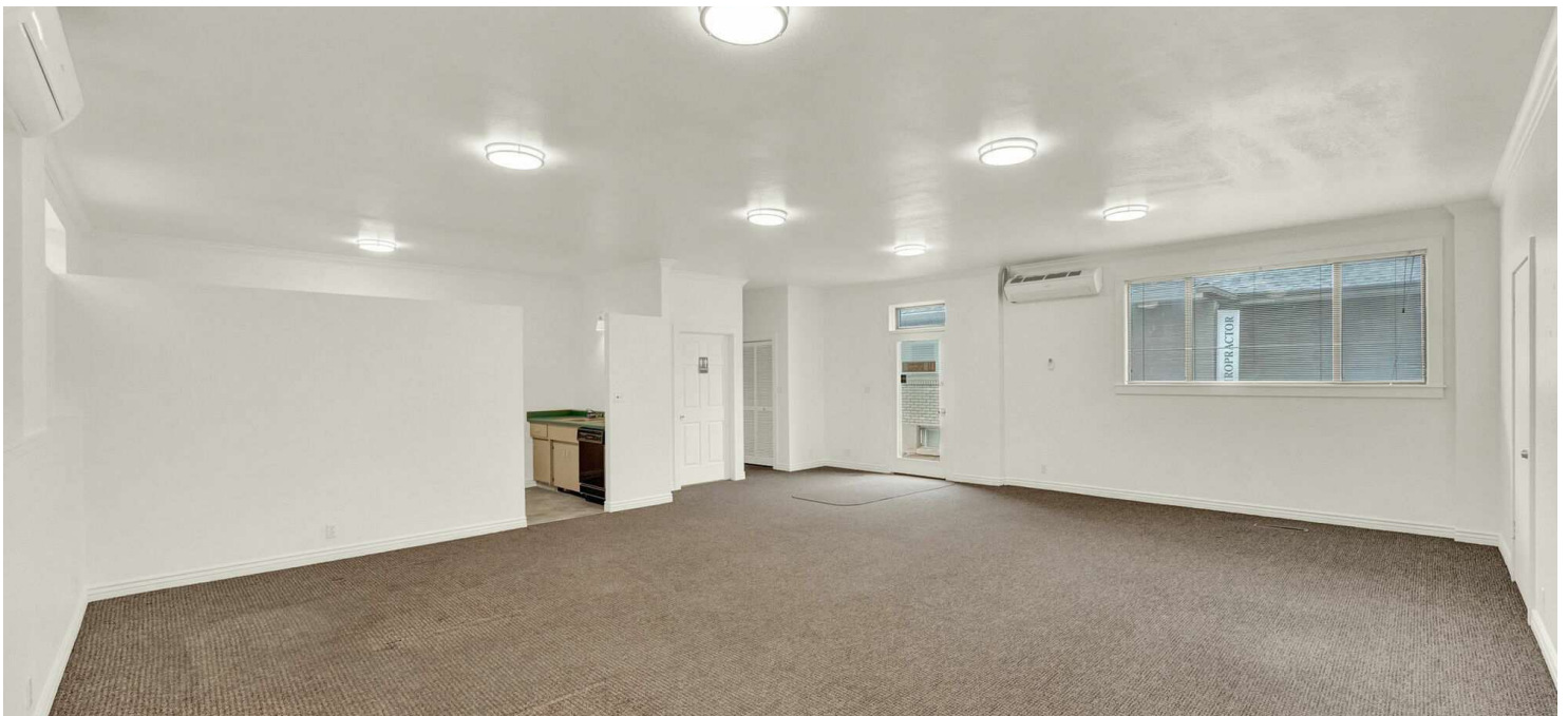
Unit B: 932 SF Retail / Office

MICHAEL FERRO 801.554.3002 ferro@iproperties.com