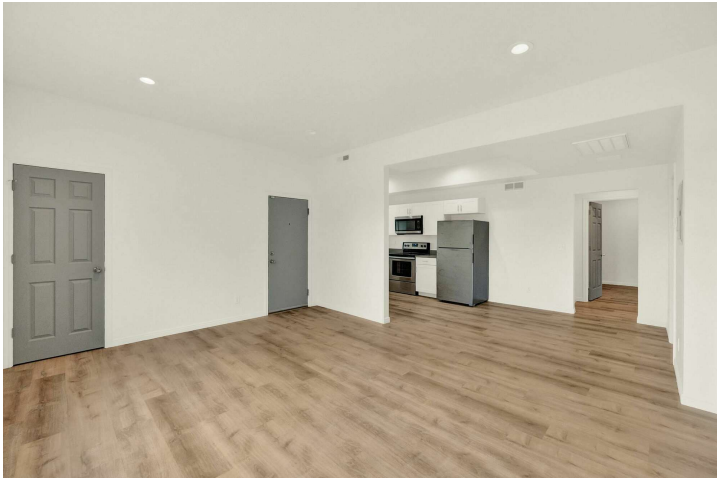
Unit C: 2-Bedroom Apartment