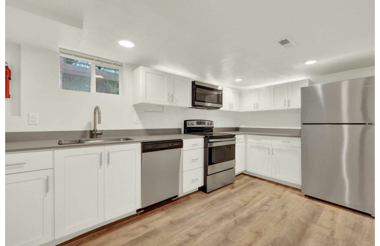
Unit D: 3-Bedroom Apartment