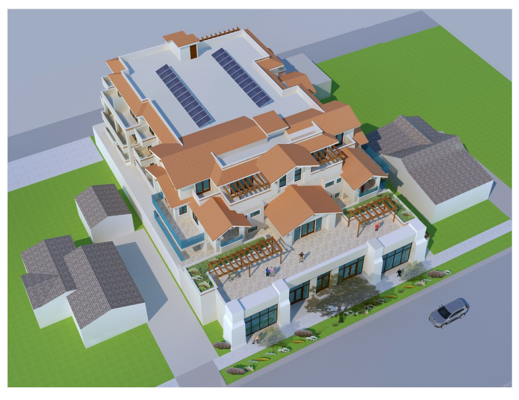
Front of New Building - Approved!