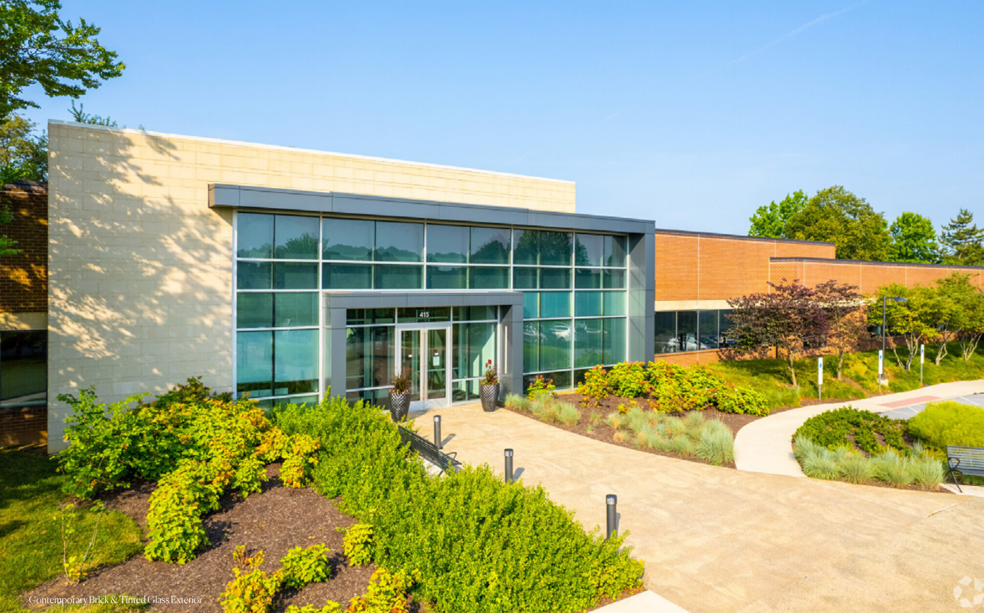
Contemporary Brick & Tinted Glass Exterior