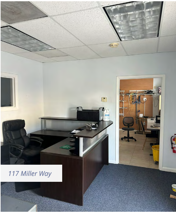
117 Miller Way