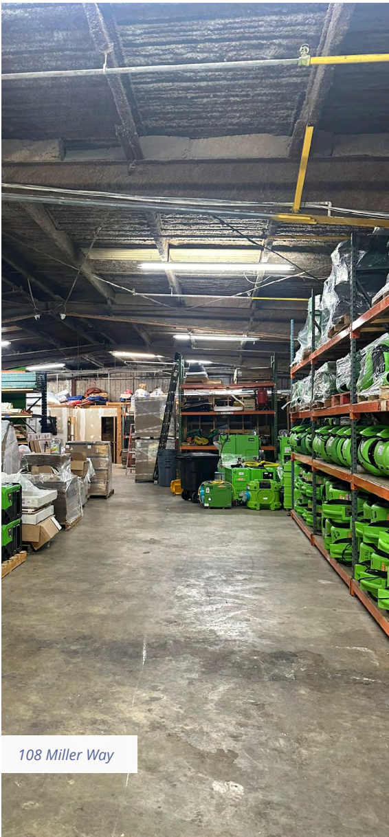
108 Miller Way