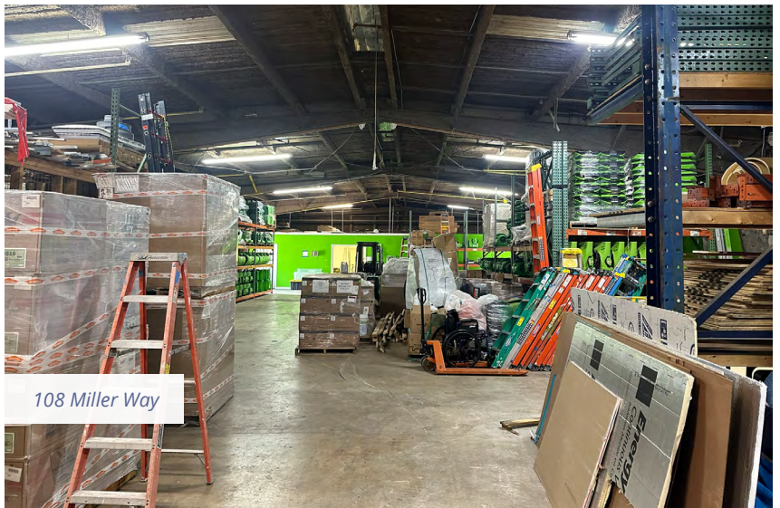
108 Miller Way