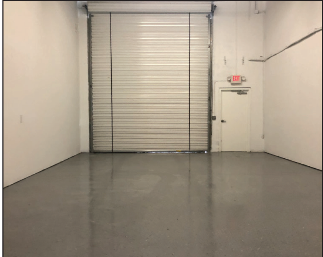
12' x 14' Overhead Door