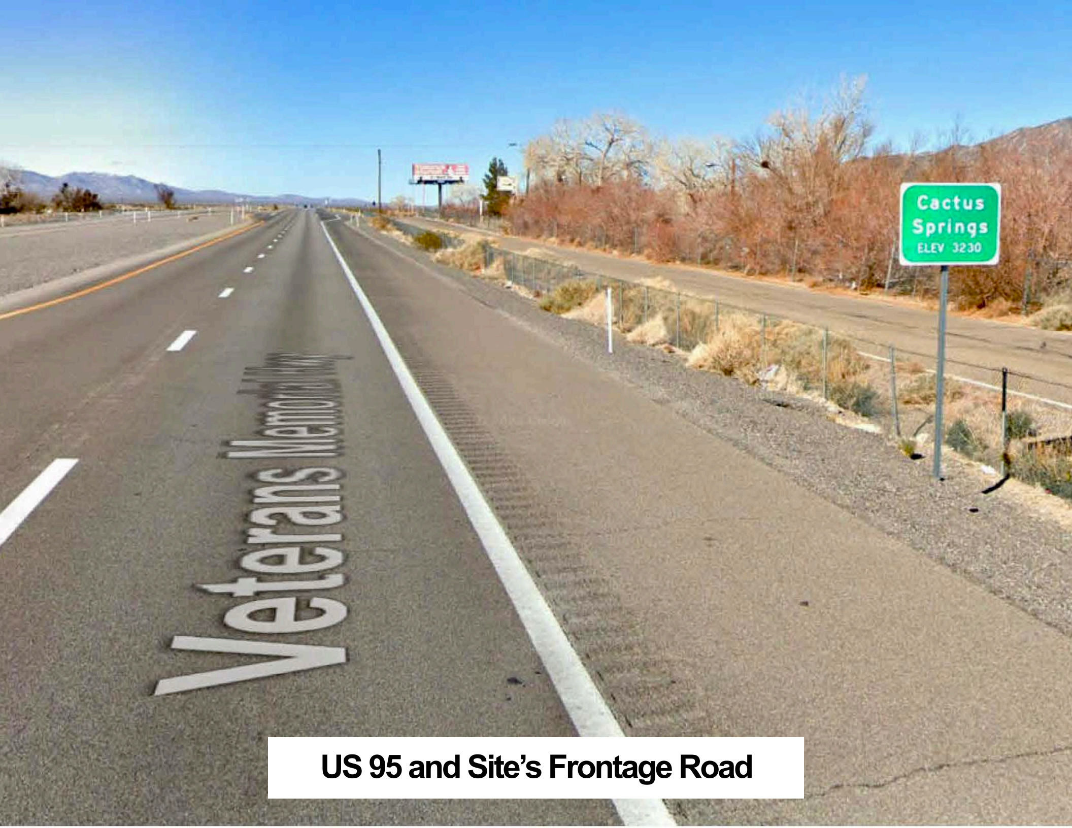
US 95 and Site's Frontage Road