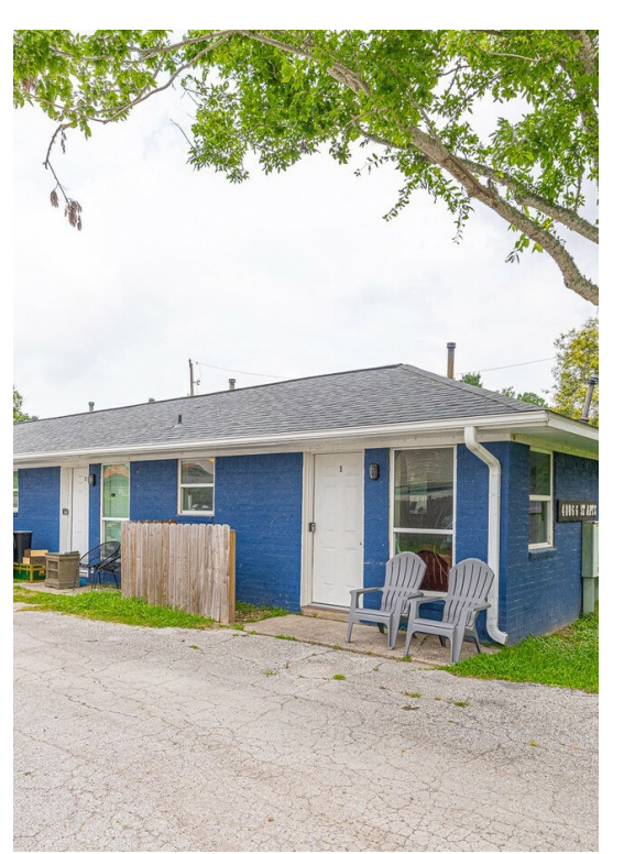
4806 6th St 4806 6th St, Bacliff, TX 77518