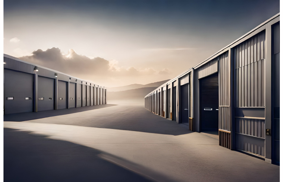
Vecteezy Concept Drawing