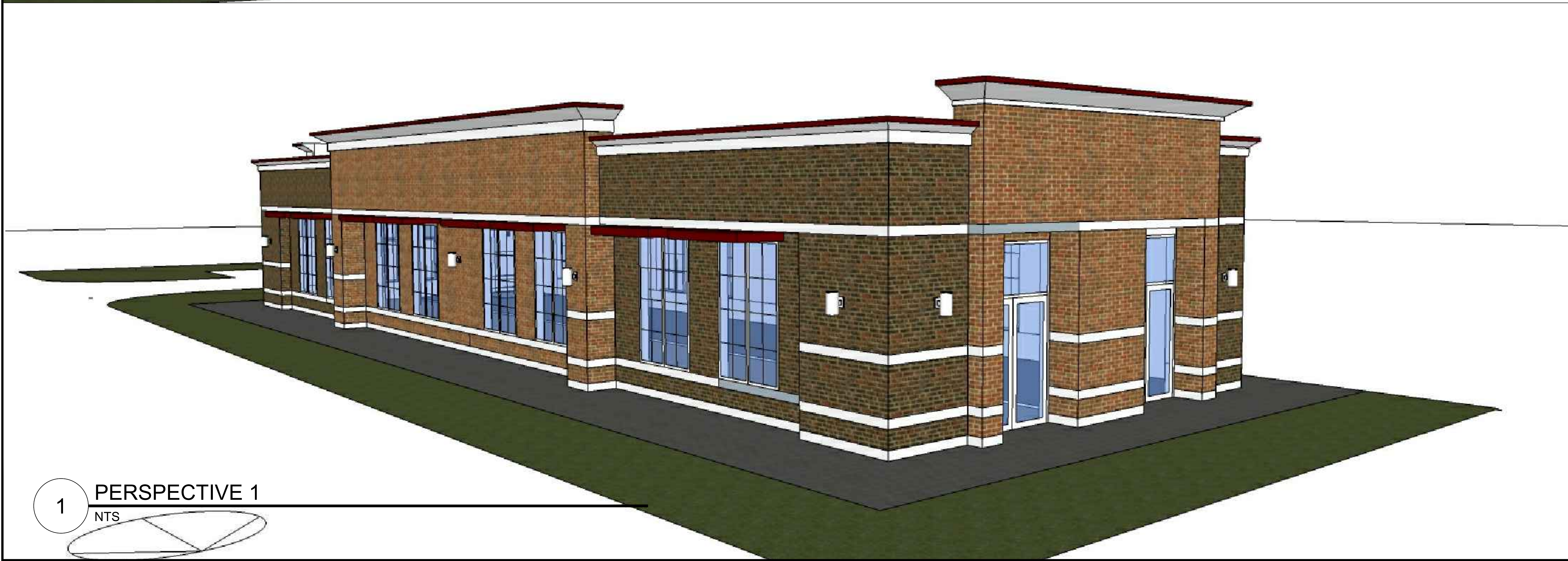
1 PERSPECTIVE 1 NTS

TP CONSTRUCTION, LLC. 1508 E. BELTLINE RD CARROLLTON, TX TEL. 469 989 6105 EMAIL: toppro04@t@gmail.com