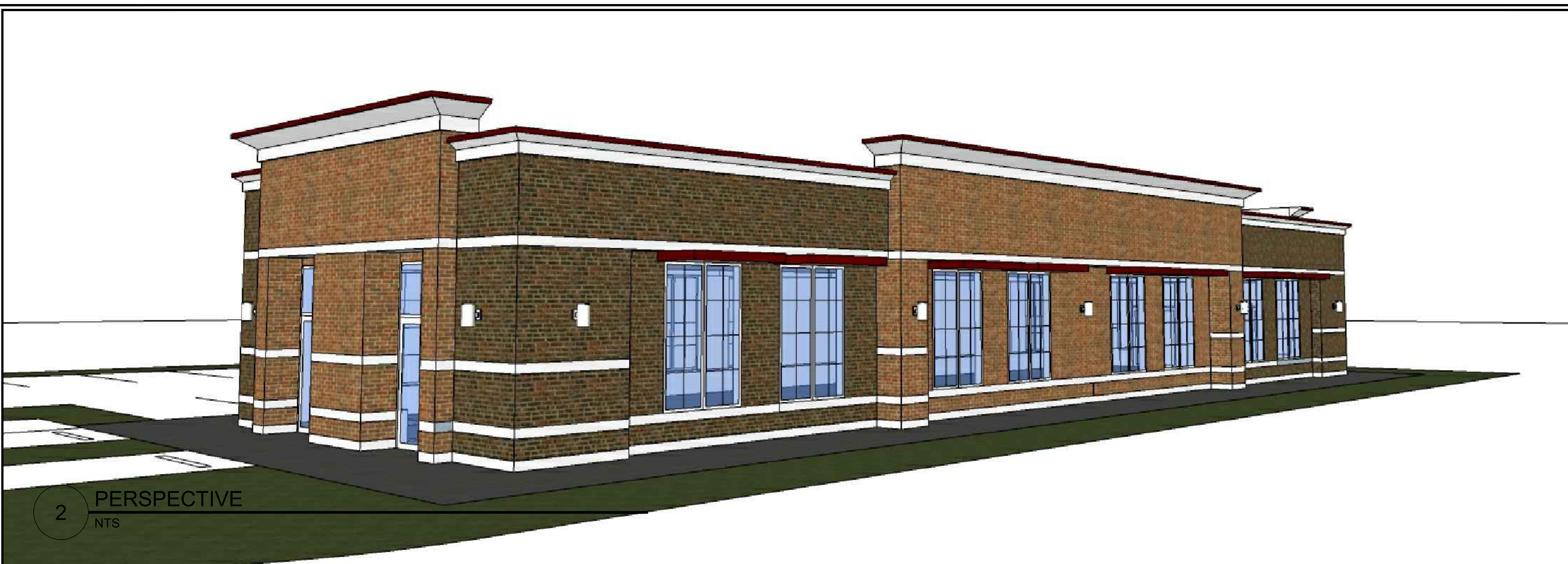
2 PERSPECTIVE NTS