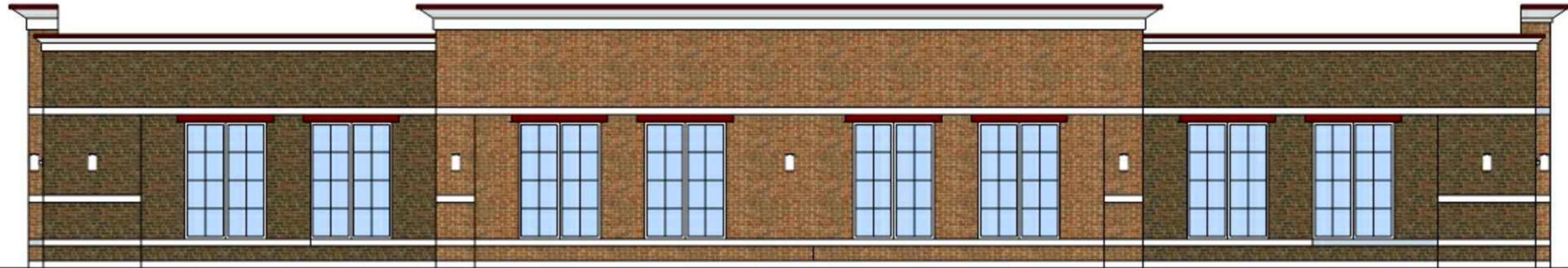
2 EAST ELEVATION 1/4" = 1'-0"