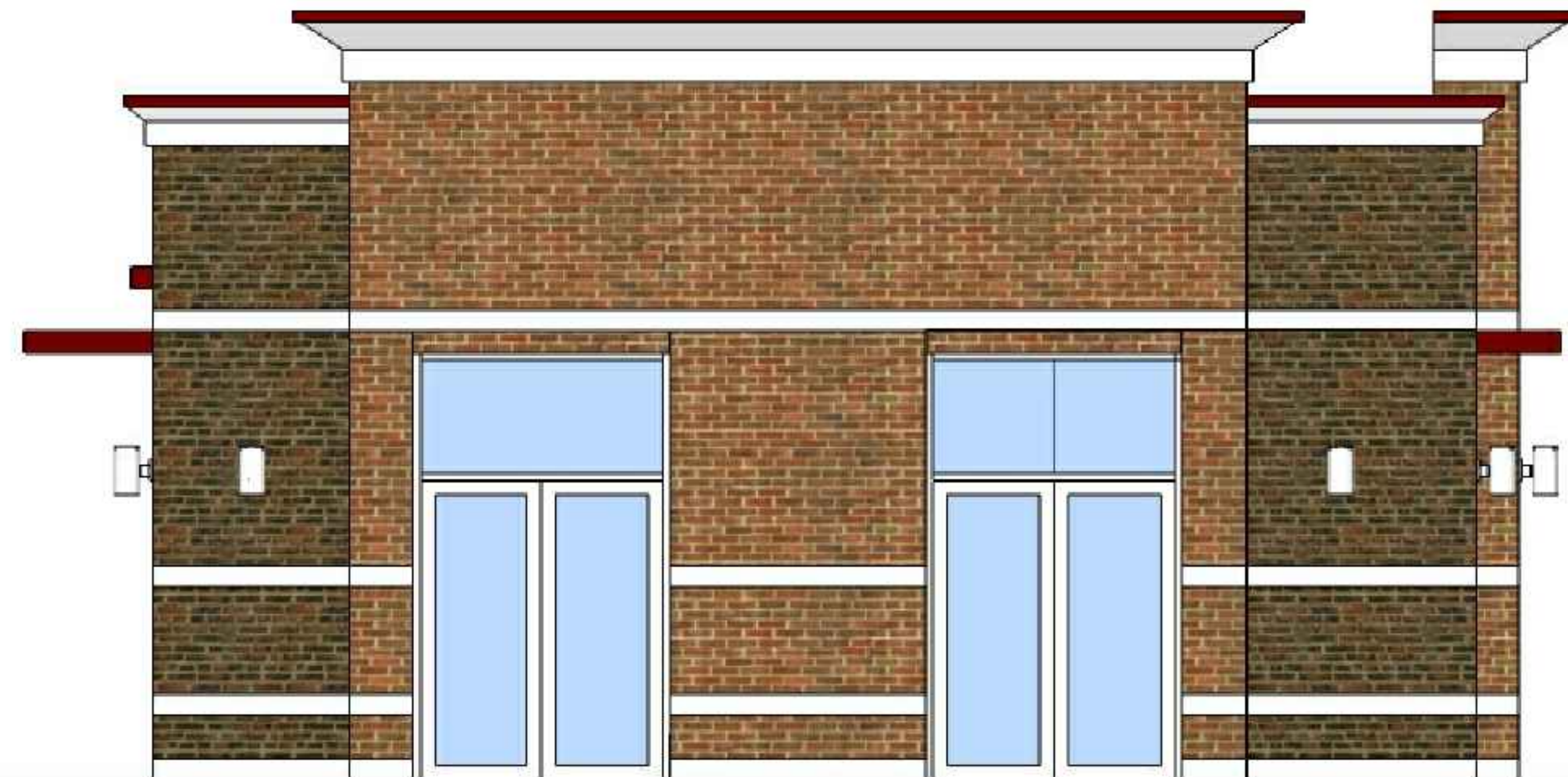
1 SOUTH ELEVATION 3/8" = 1'-0"