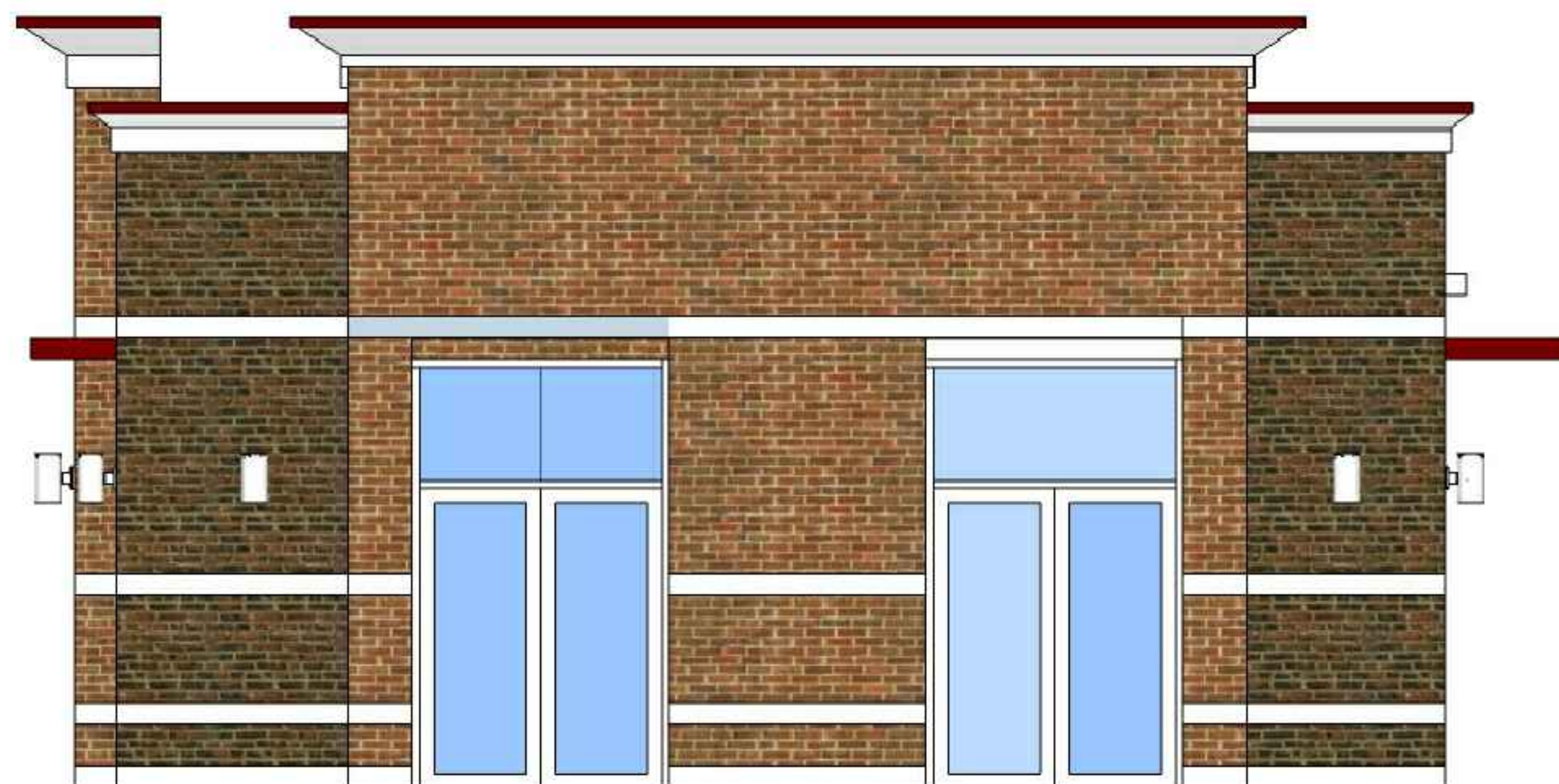
3 NORTH ELEVATION 3/8" = 1'-0"