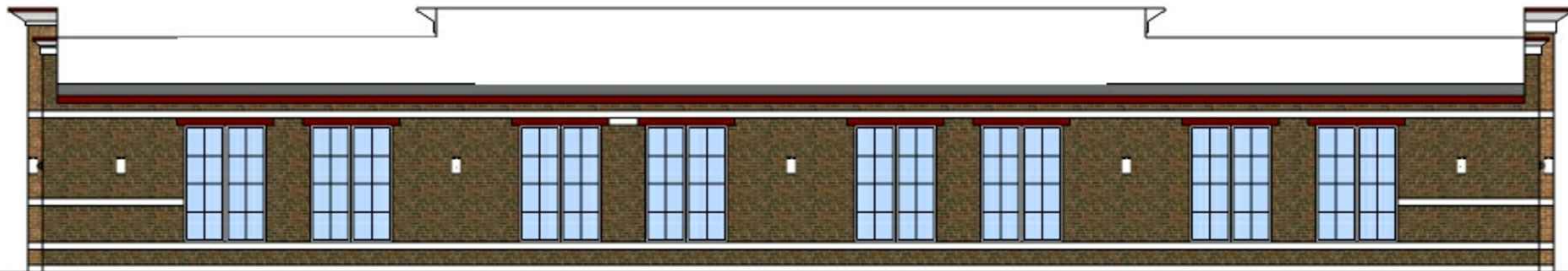
4 WEST ELEVATION 1/4" = 1'-0"