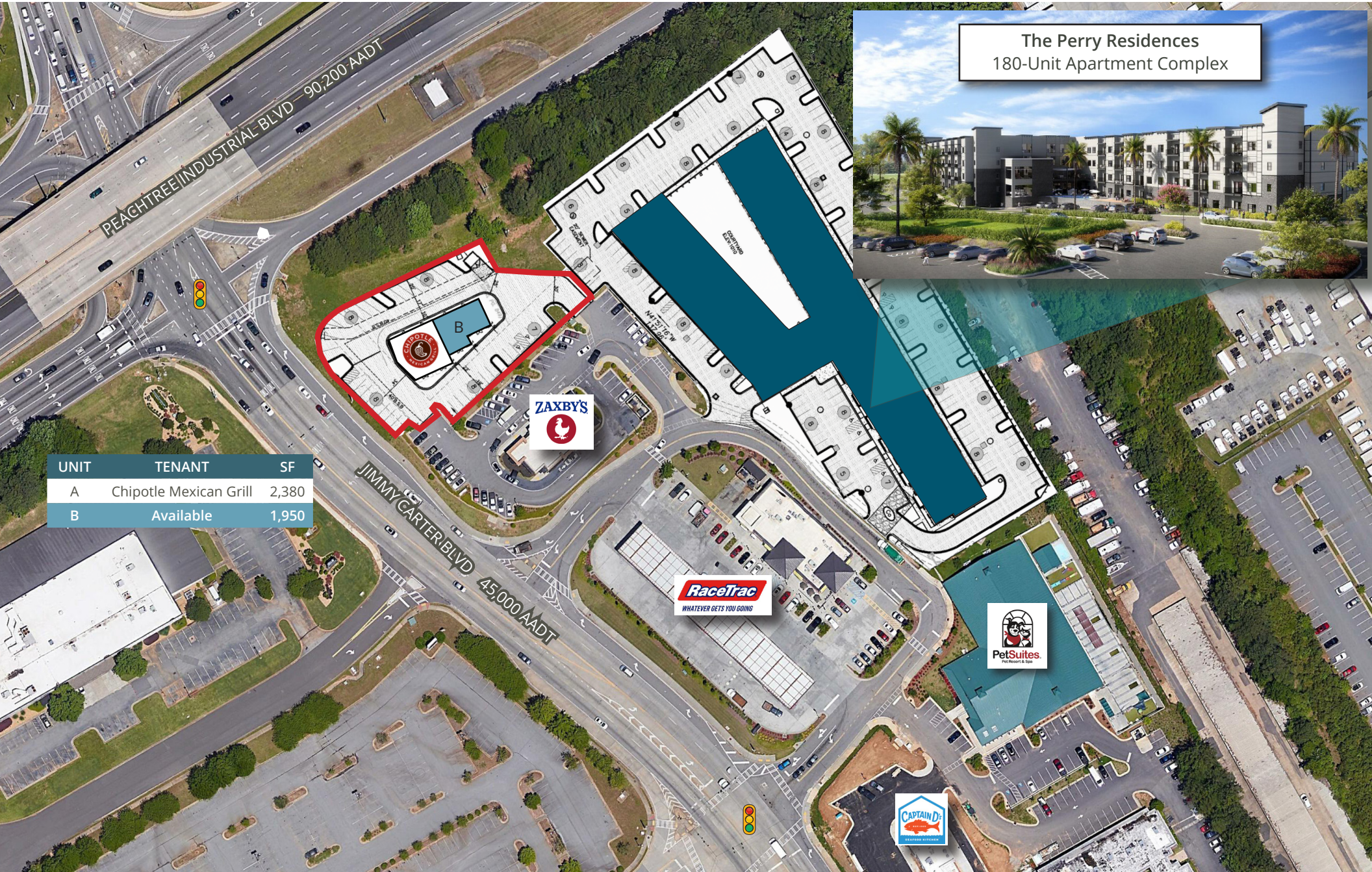
The Perry Residences 180-Unit Apartment Complex