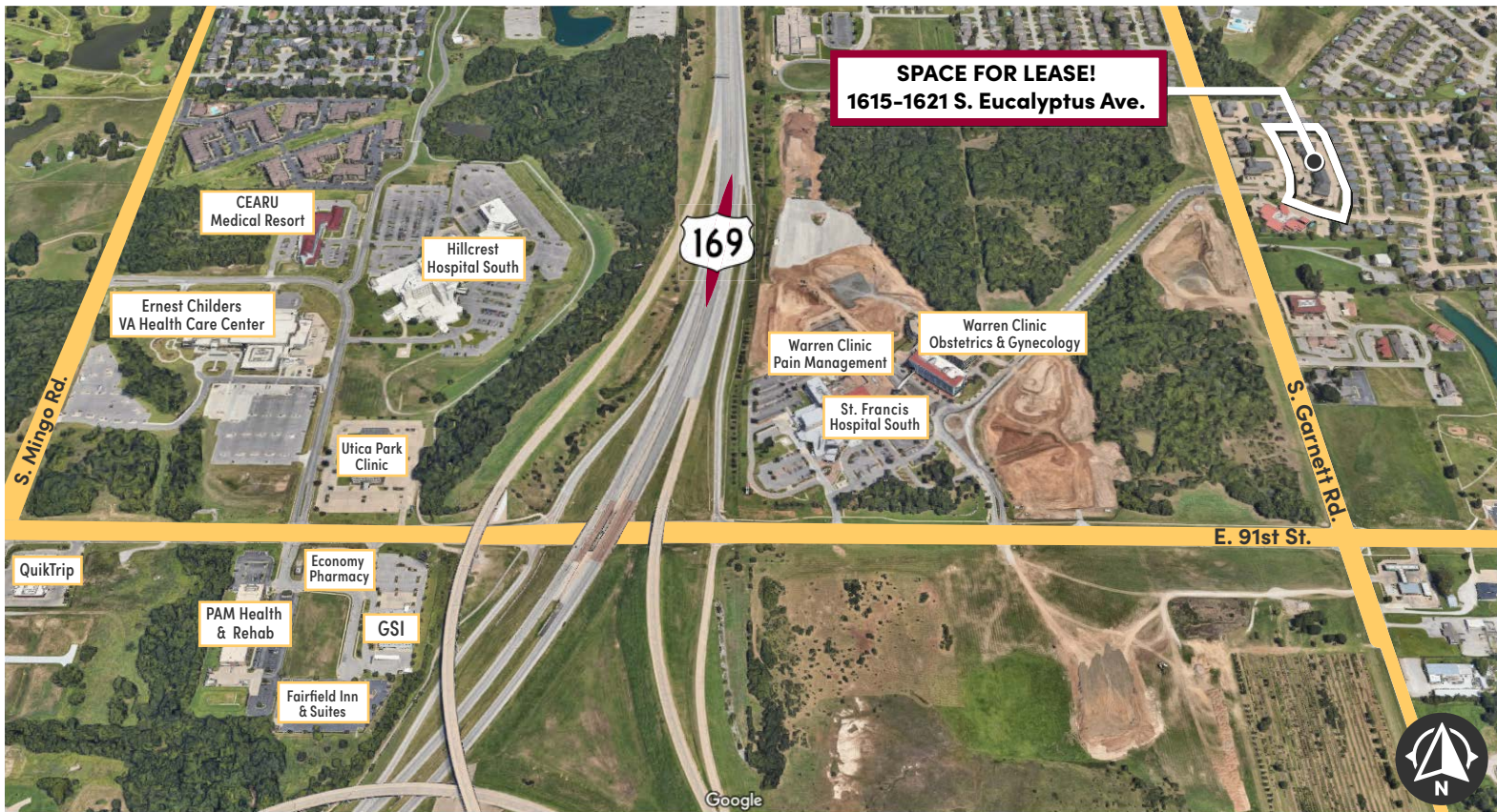
Greater Tulsa Area Map