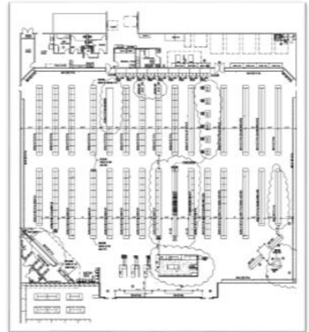
As-Built Floor Plan