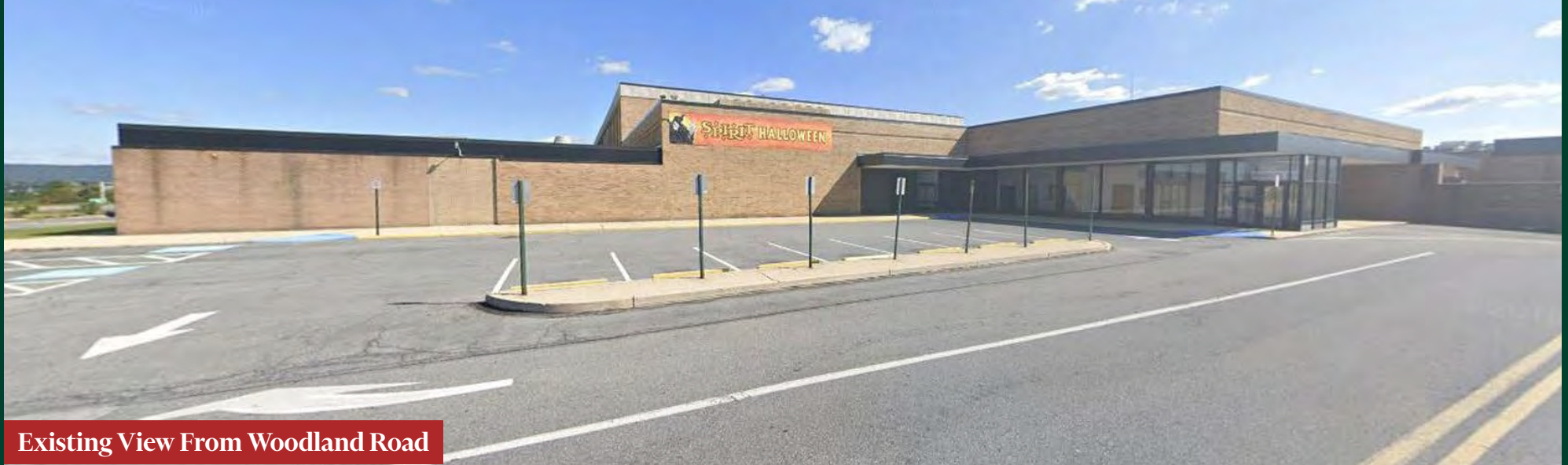
Existing View From Woodland Road