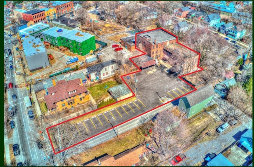
2067 W. 41 st St., Cleveland, OH 44113

No warranty or representation, express or implied, is made as to the accuracy of the information contained herein. It is submitted subject to errors, omissions, price changes, rental or other conditions, withdrawal without notice, and to any special listing conditions imposed by our client.