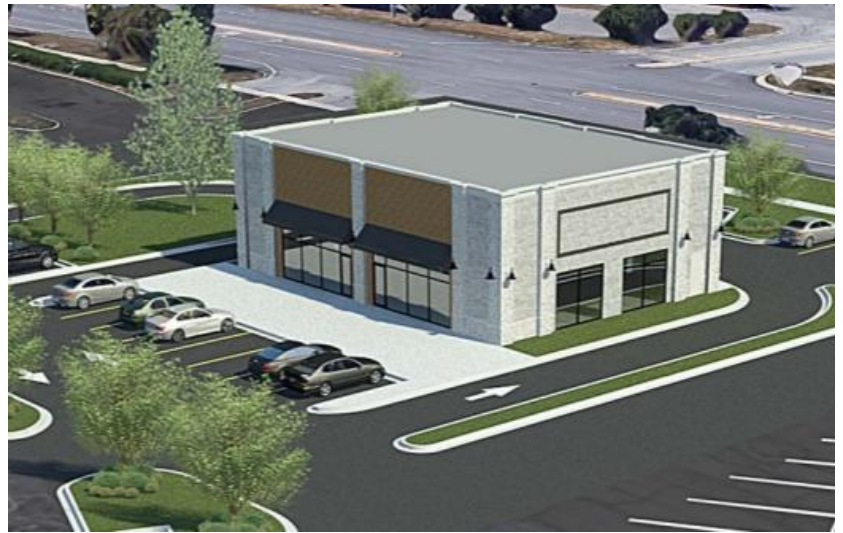
3,500 SF Single or Multi-Tenant Building