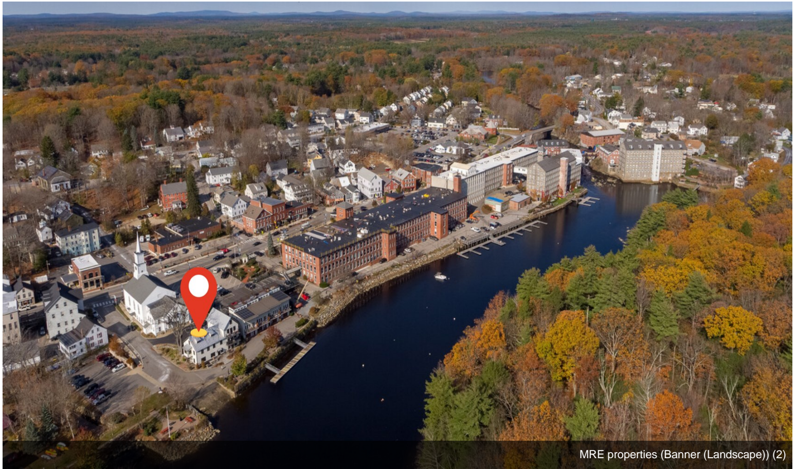
MRE properties (Banner (Landscape)) (2)