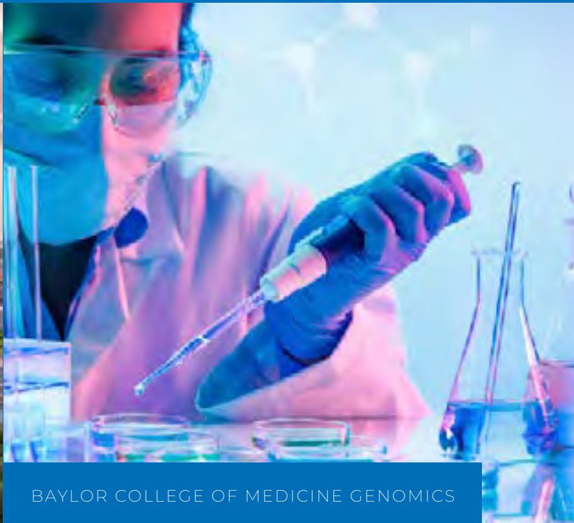
BAYLOR COLLEGE OF MEDICINE GENOMICS