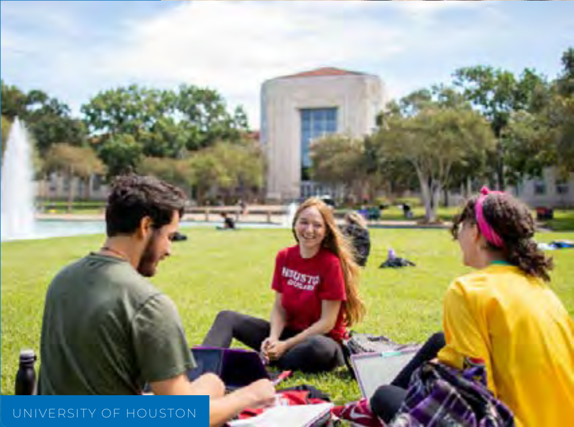
UNIVERSITY OF HOUSTON