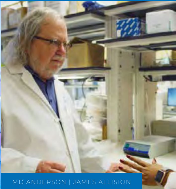
MD ANDERSON | JAMES ALLISON