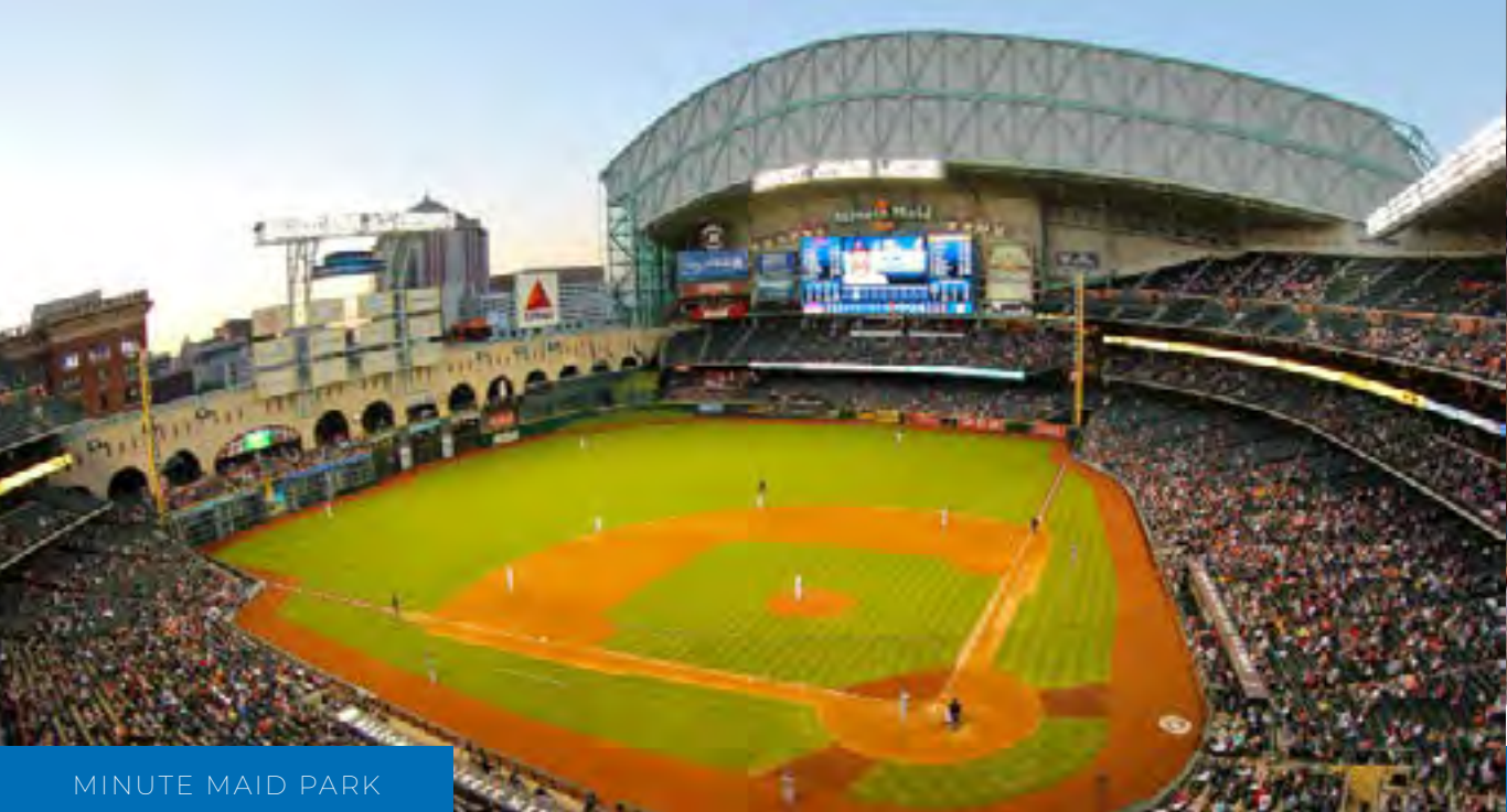
MINUTE MAID PARK