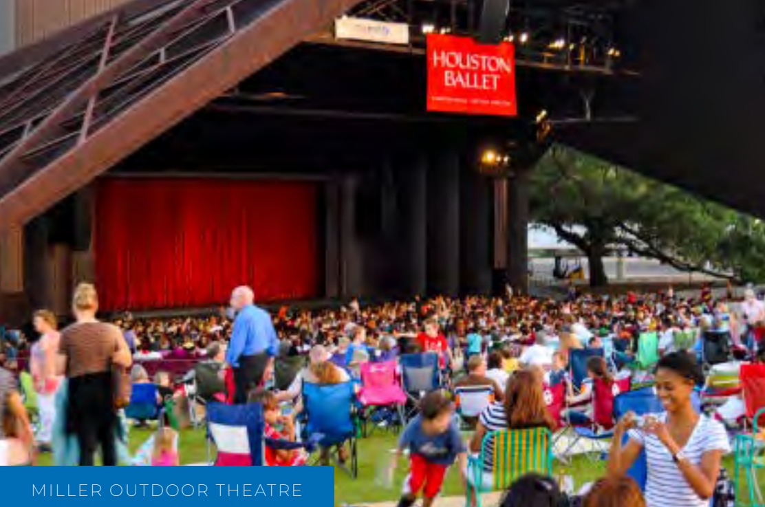
MILLER OUTDOOR THEATRE