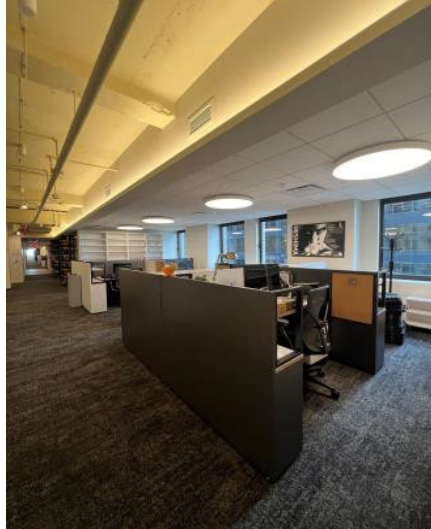
SMALL CUBICAL AREA