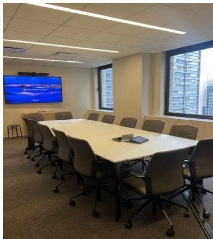
SAMPLE LARGER COMMUNAL MEETING ROOM