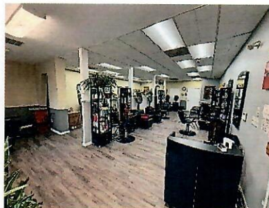
Interior view – laminate floors