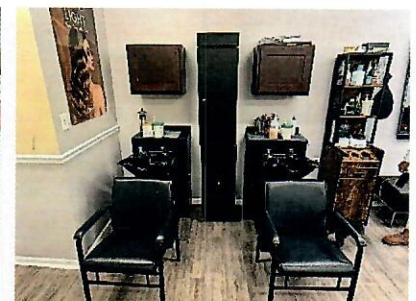
2 shampoo bowls can remain