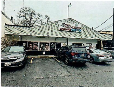
Exterior view of building