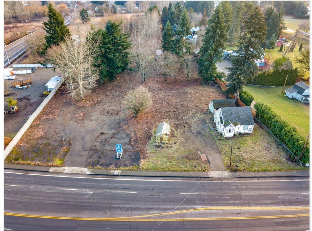
8621 NE St Johns Rd-6