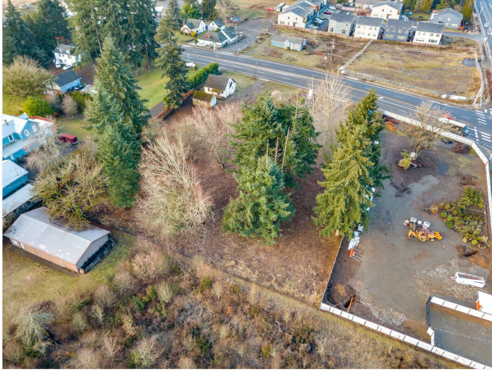
8621 NE St Johns Rd-14