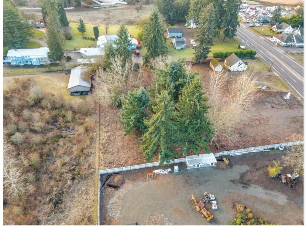
8621 NE St Johns Rd-15