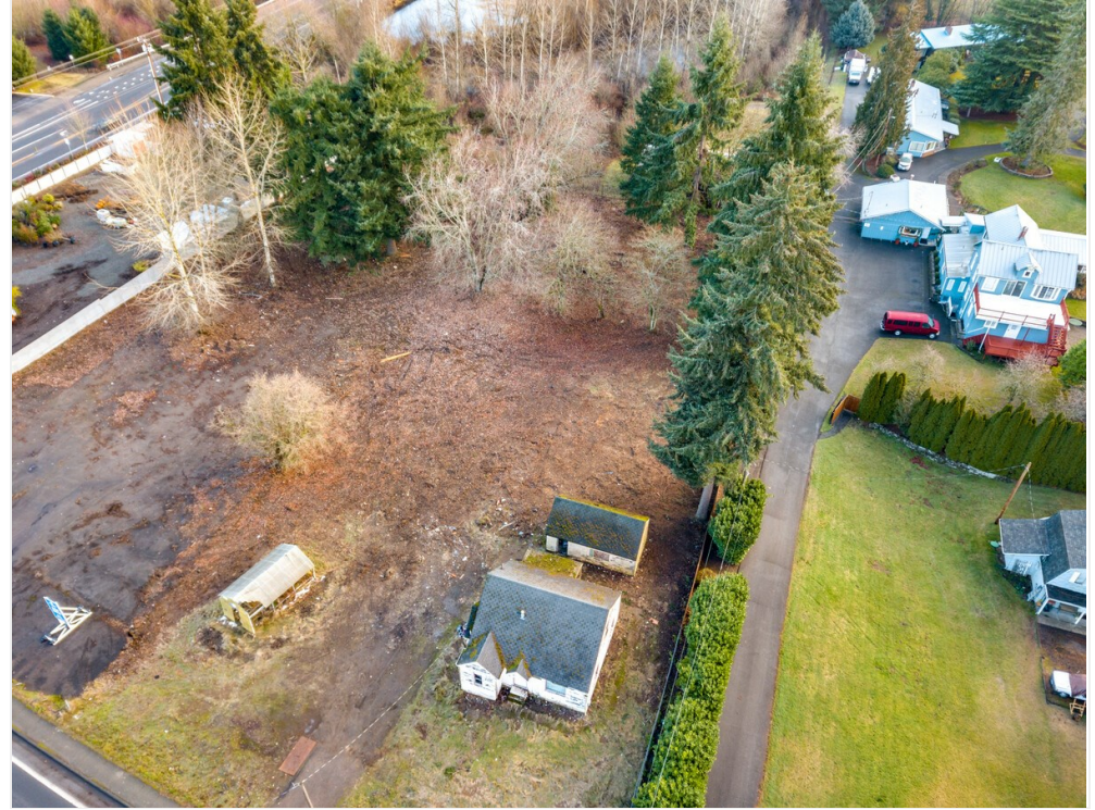
8621 NE St Johns Rd-11