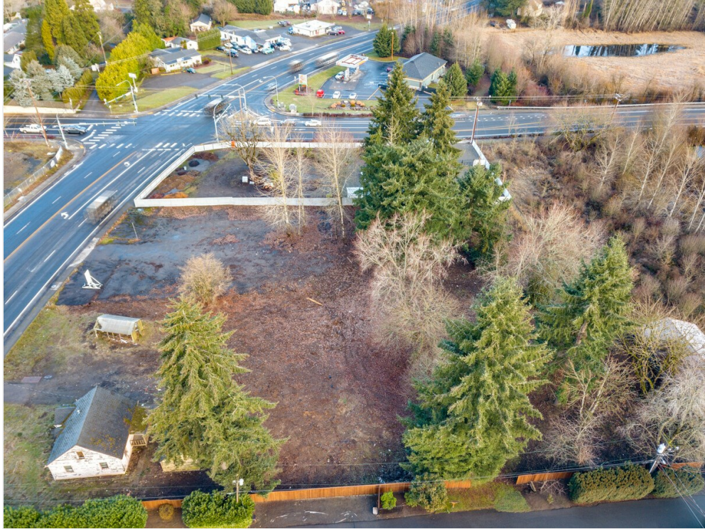
8621 NE St Johns Rd-12