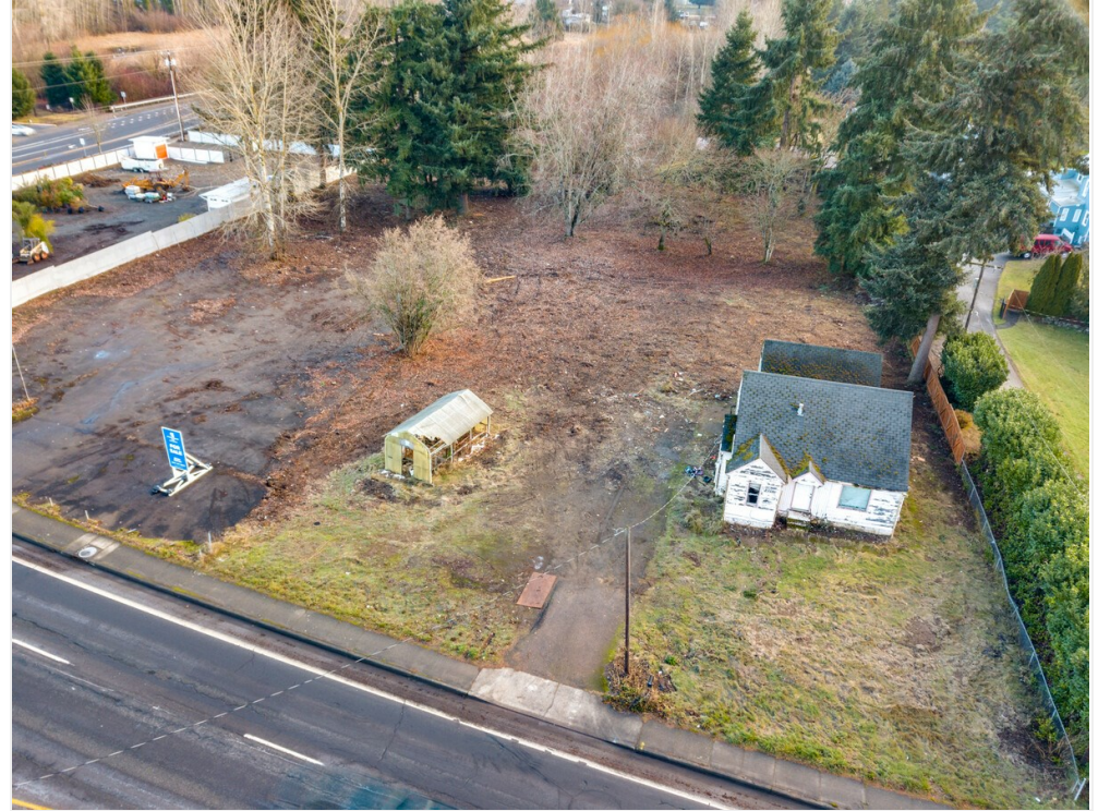
8621 NE St Johns Rd-4