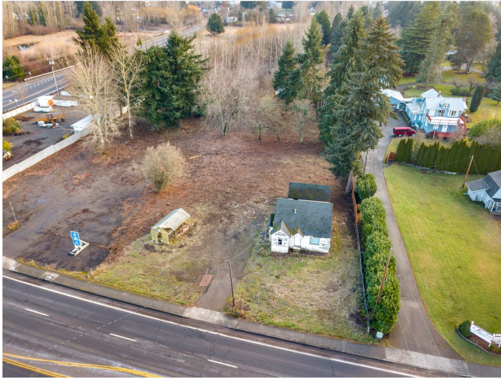
8621 NE St Johns Rd-5