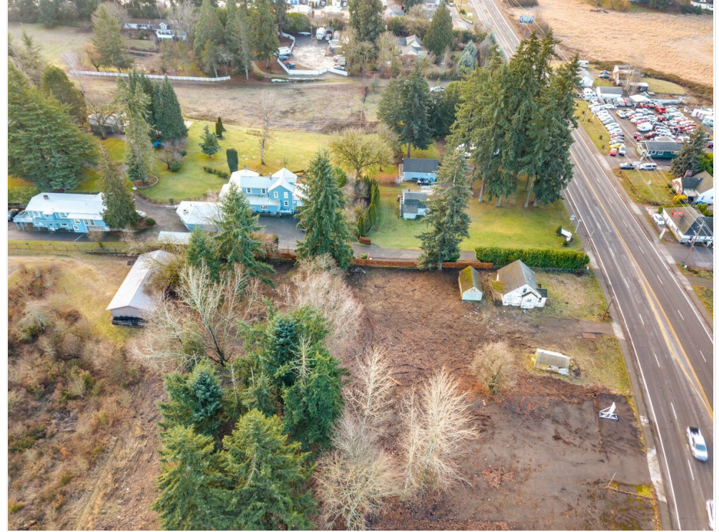
8621 NE St Johns Rd-17