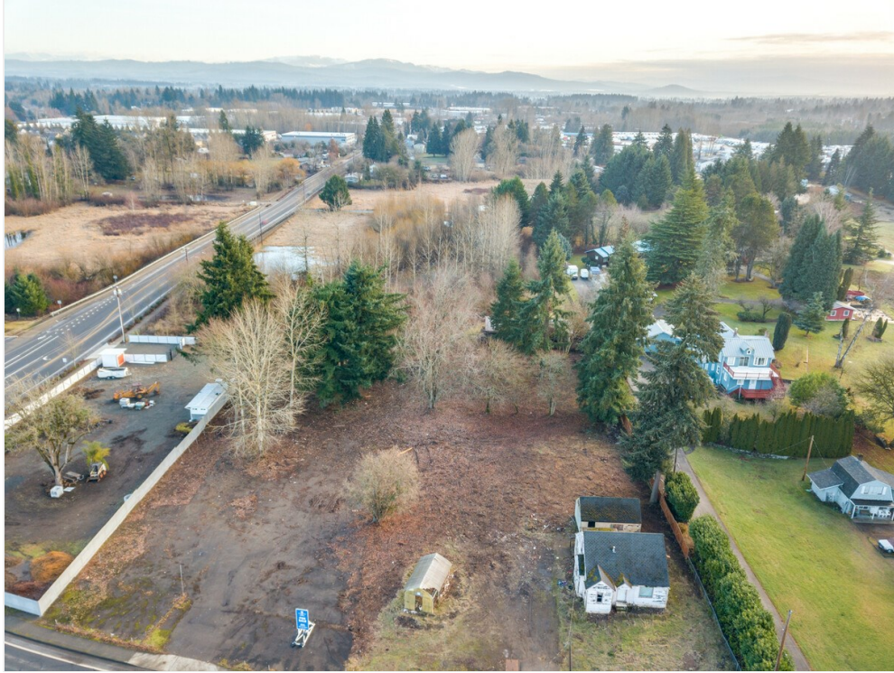
8621 NE St Johns Rd-10