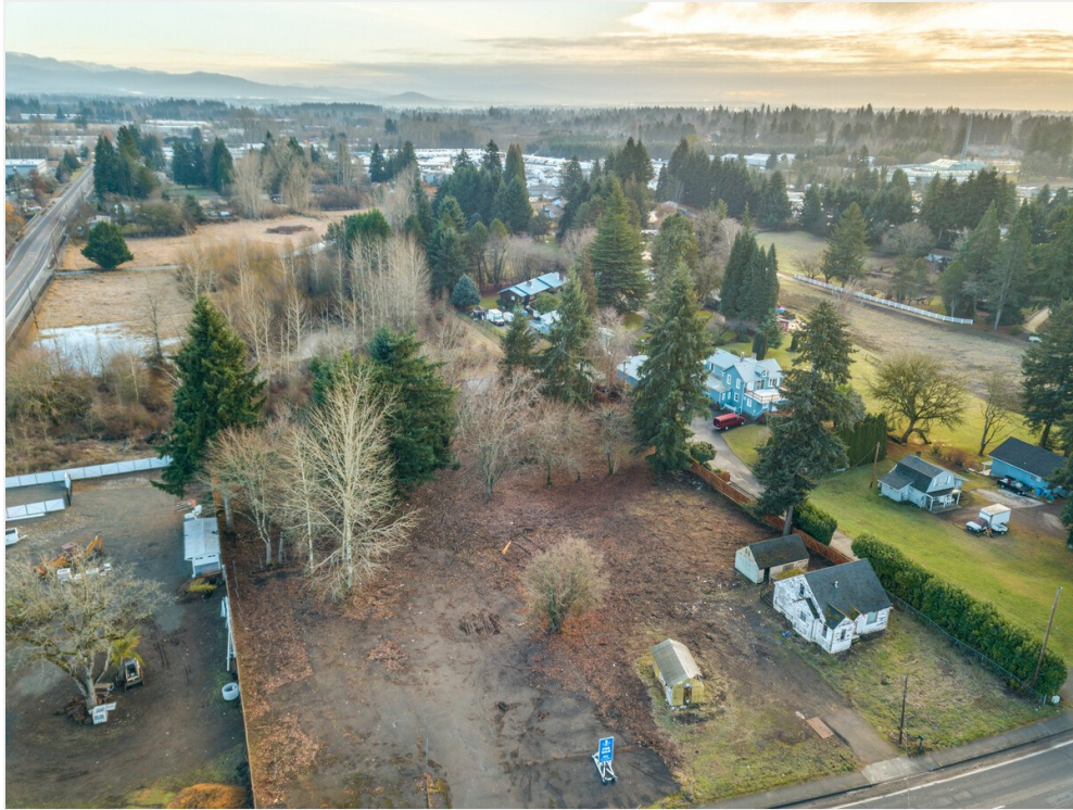
8621 NE St Johns Rd-8