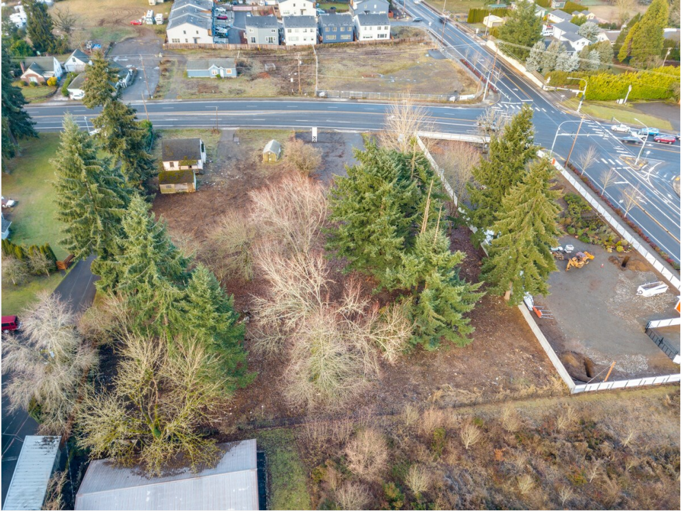
8621 NE St Johns Rd-13