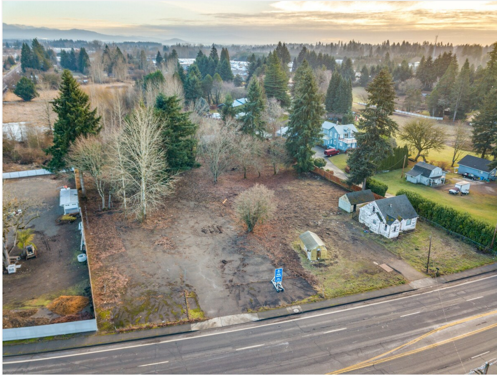
8621 NE St Johns Rd-7