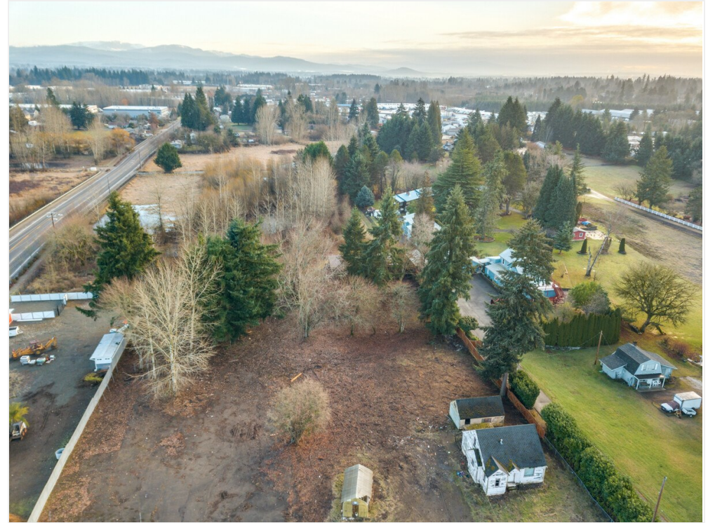
8621 NE St Johns Rd-9