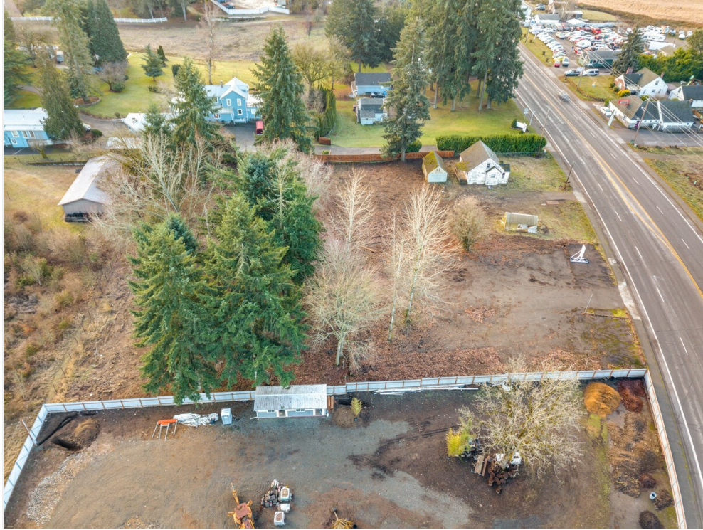
8621 NE St Johns Rd-16