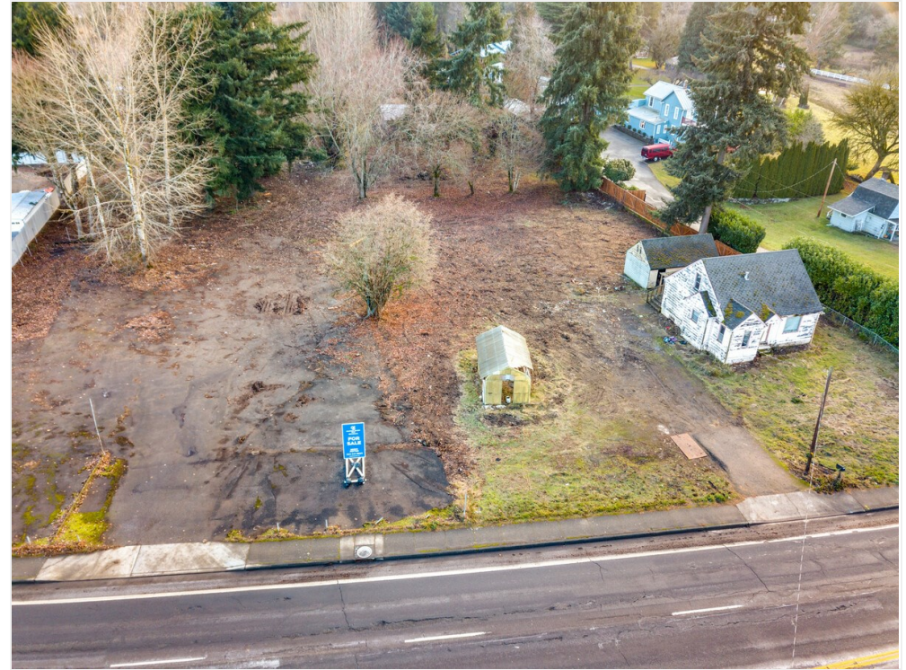
8621 NE St Johns Rd-3