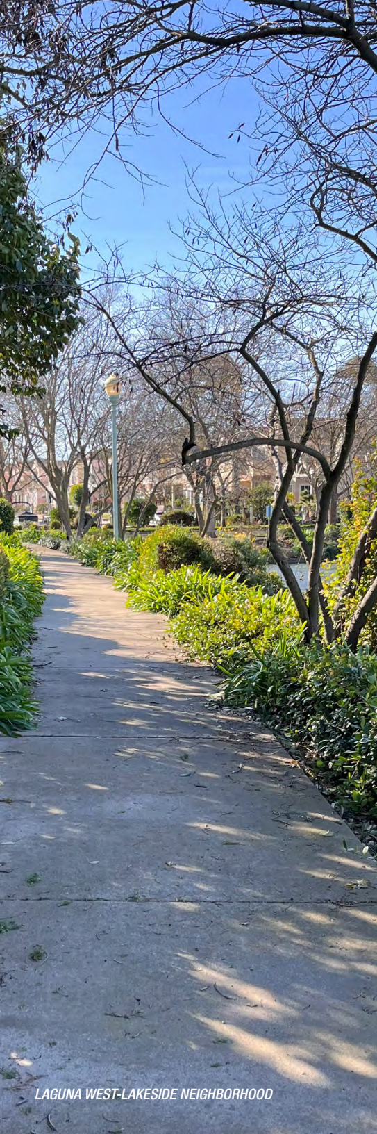
LAGUNA WEST-LAKESIDE NEIGHBORHOOD