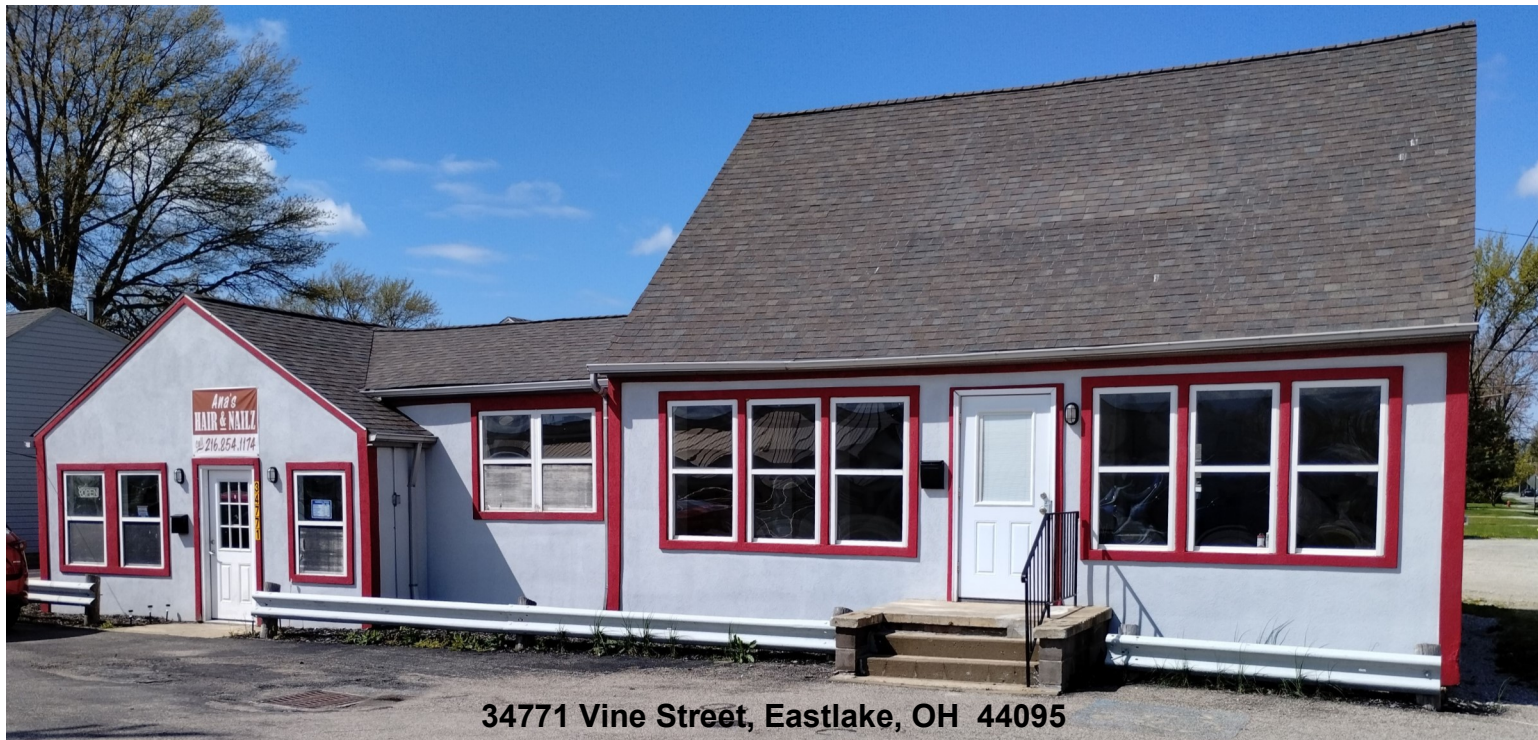
34771 Vine Street, Eastlake, OH 44095