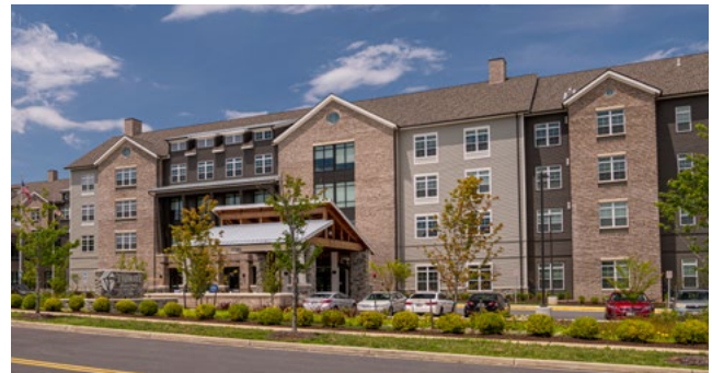
Tribute at Melford Town Center

For more information on the residential component at Melford Town Center, visit: MelfordTownCenter.com