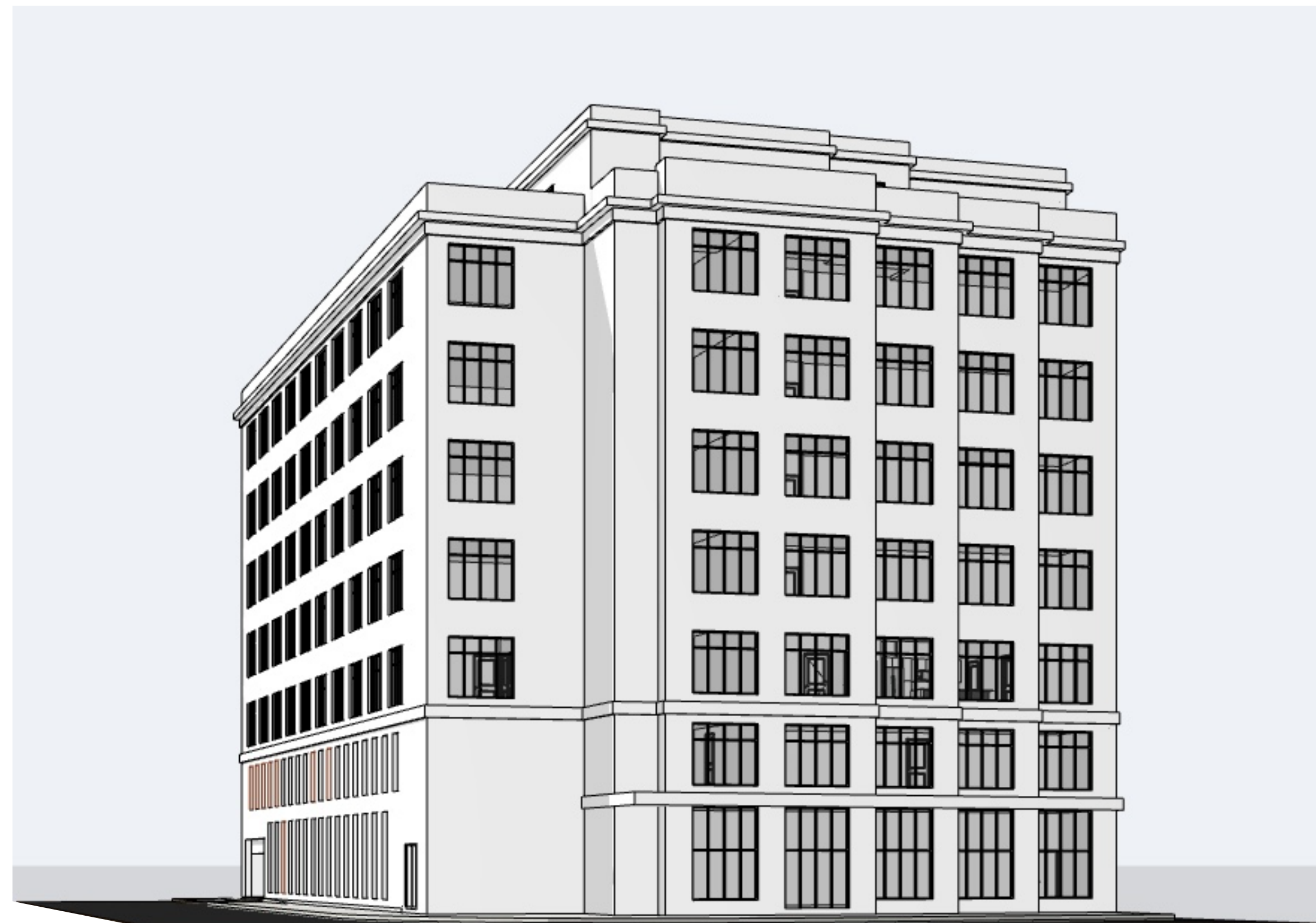
Dock Street Elevation