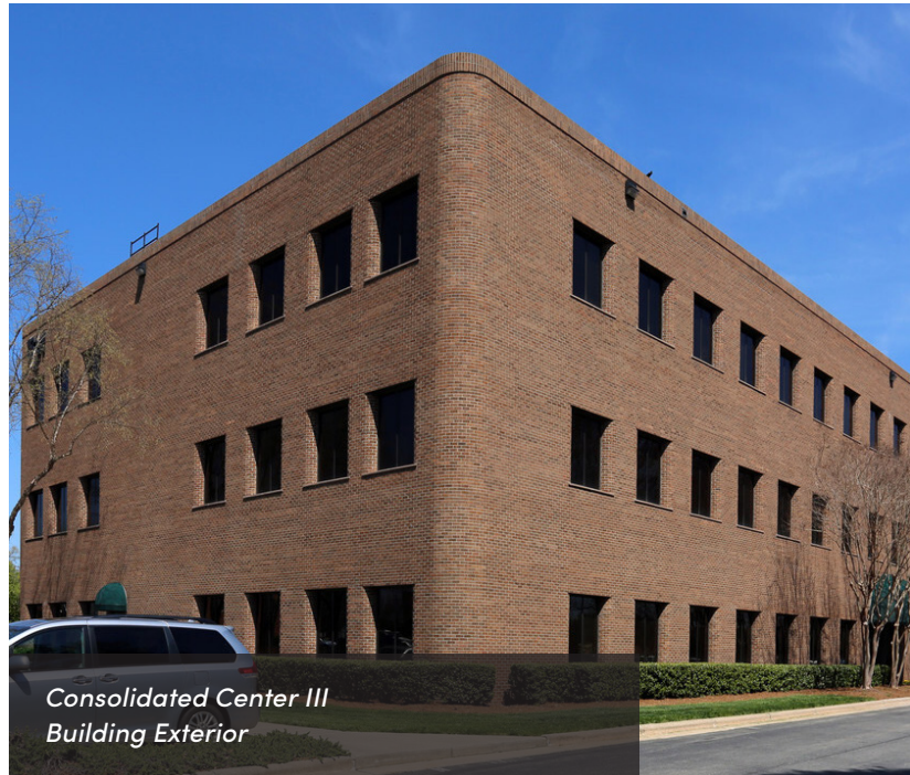
Consolidated Center III Building Exterior