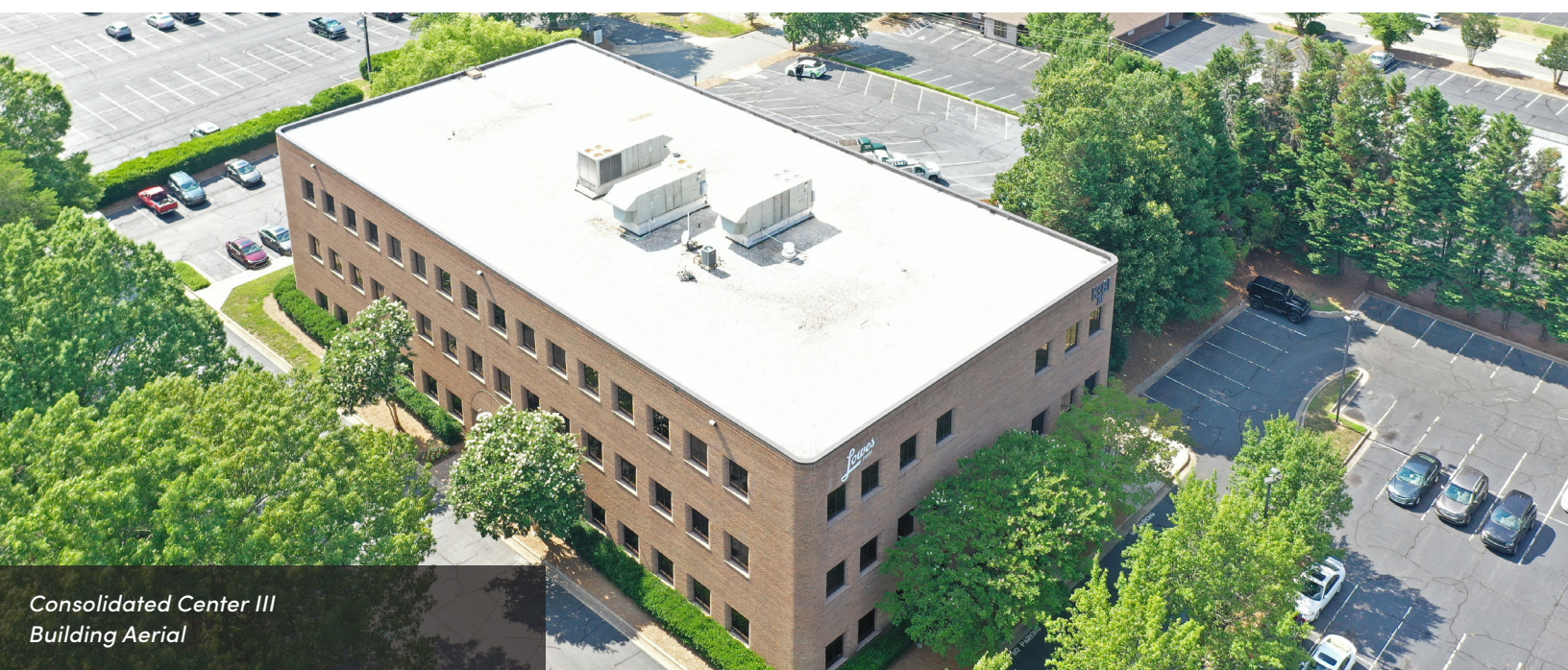
Consolidated Center III Building Aerial