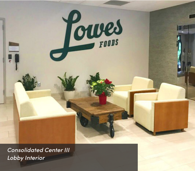
Consolidated Center III Lobby Interior