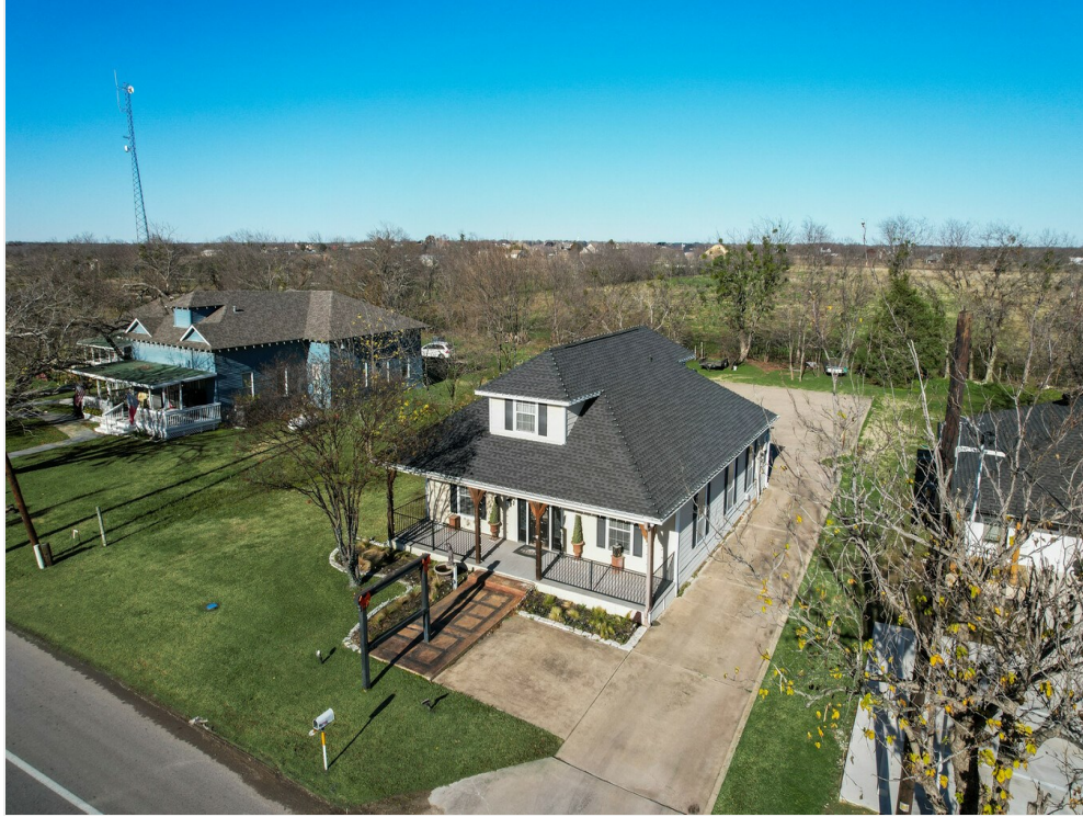
Full Quarter Acre lot