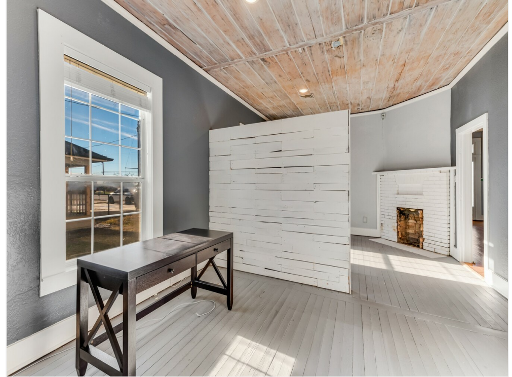
Semi Private Office