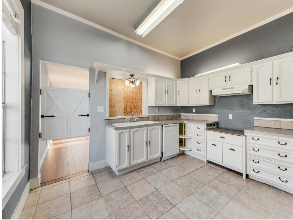
Kitchen - Break area