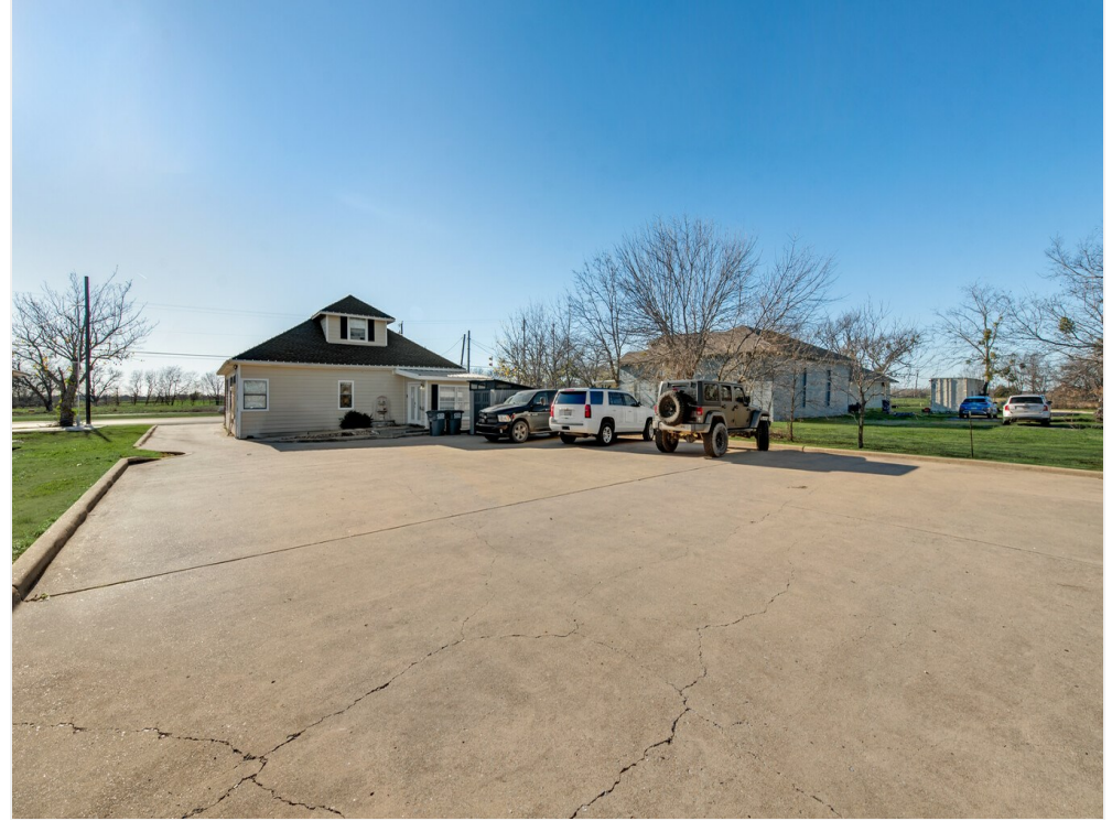
Plenty of parking in back