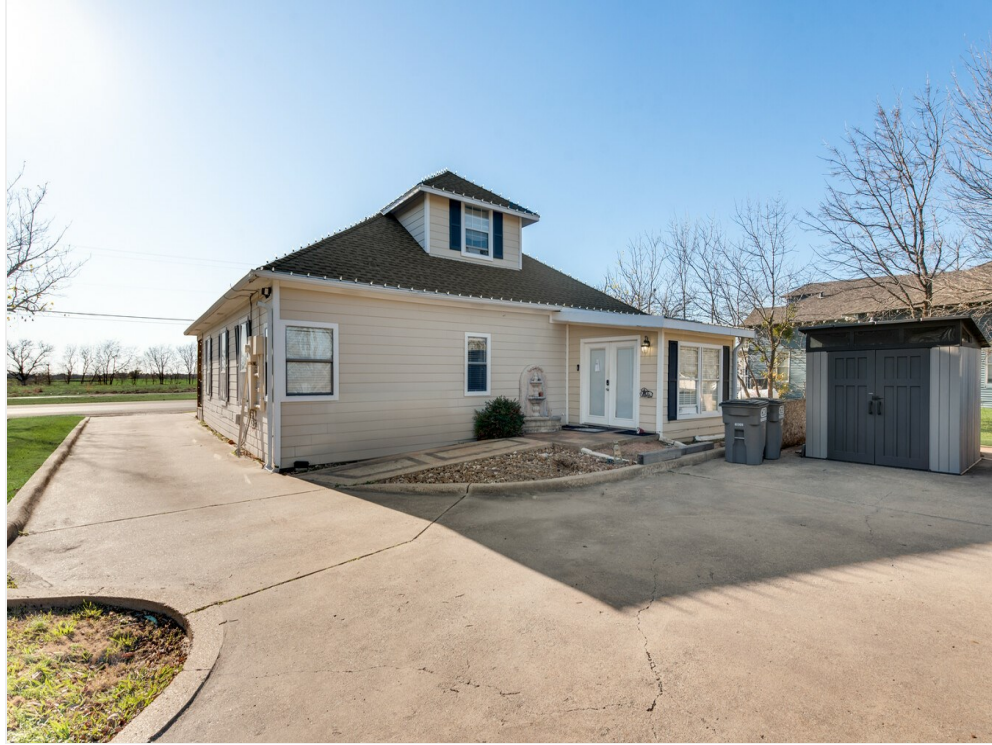
Back Entry to Office