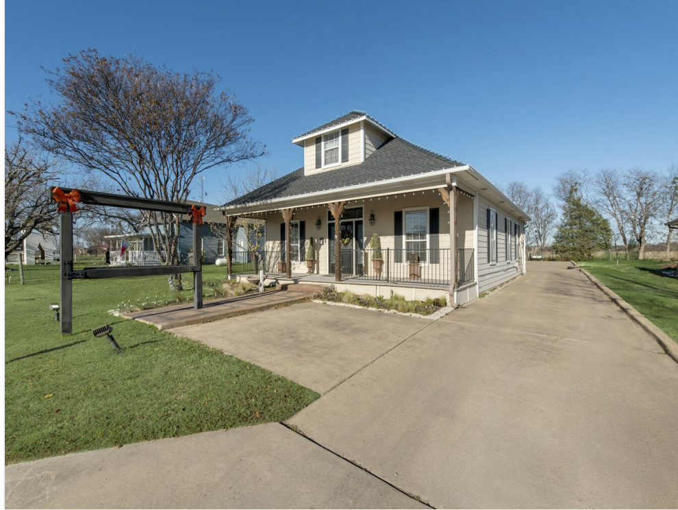
Classic front elevation