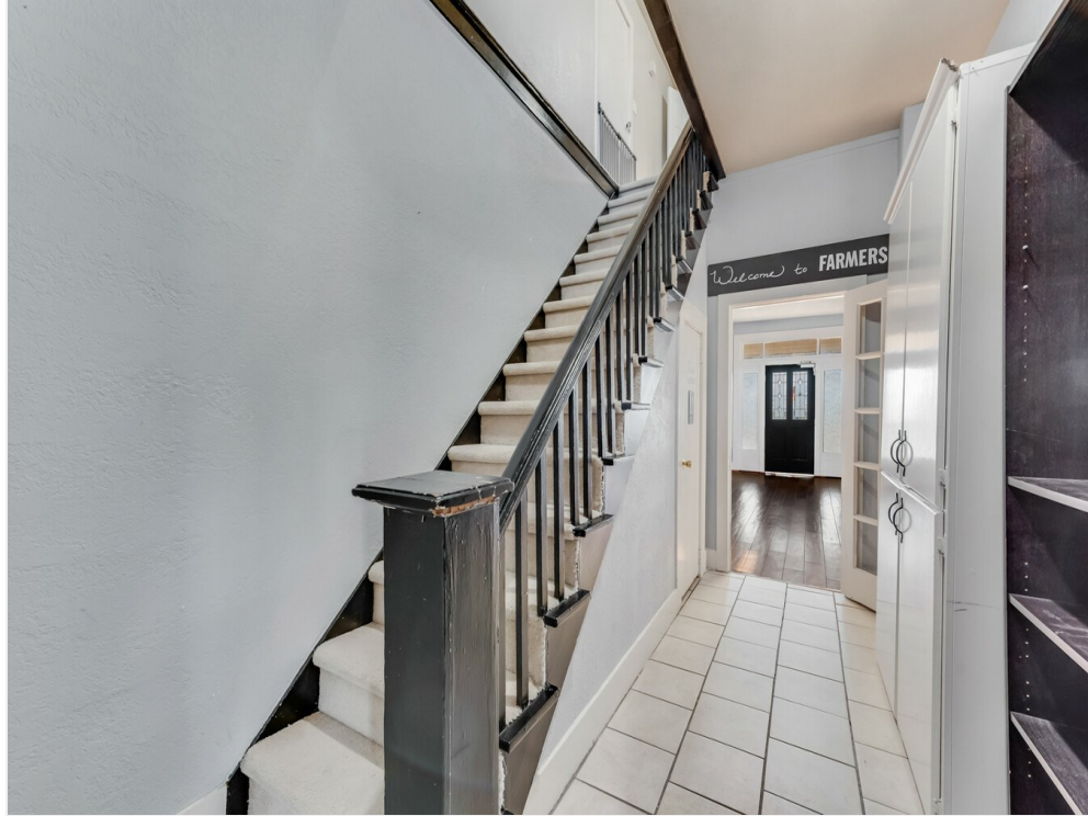
Private Office & Mezzanine up