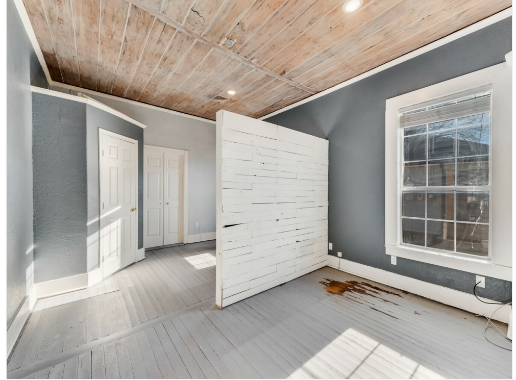
Semi Private office