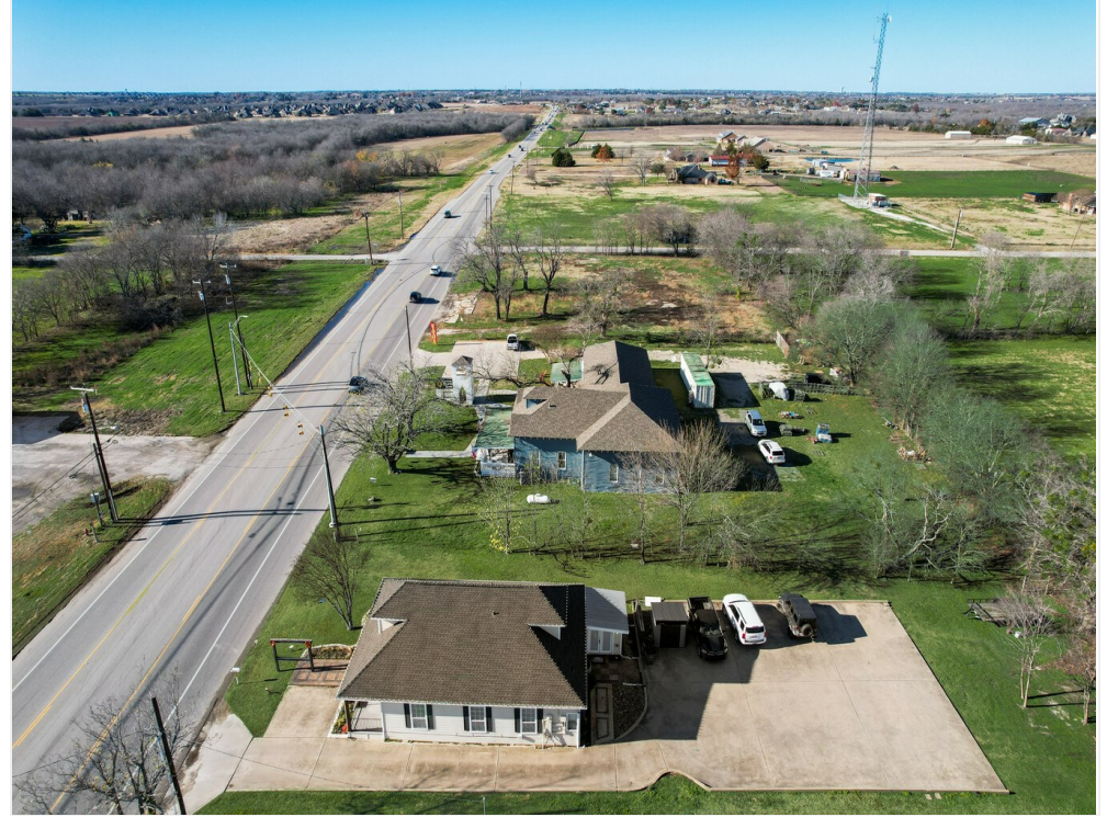
Great location on SH 205