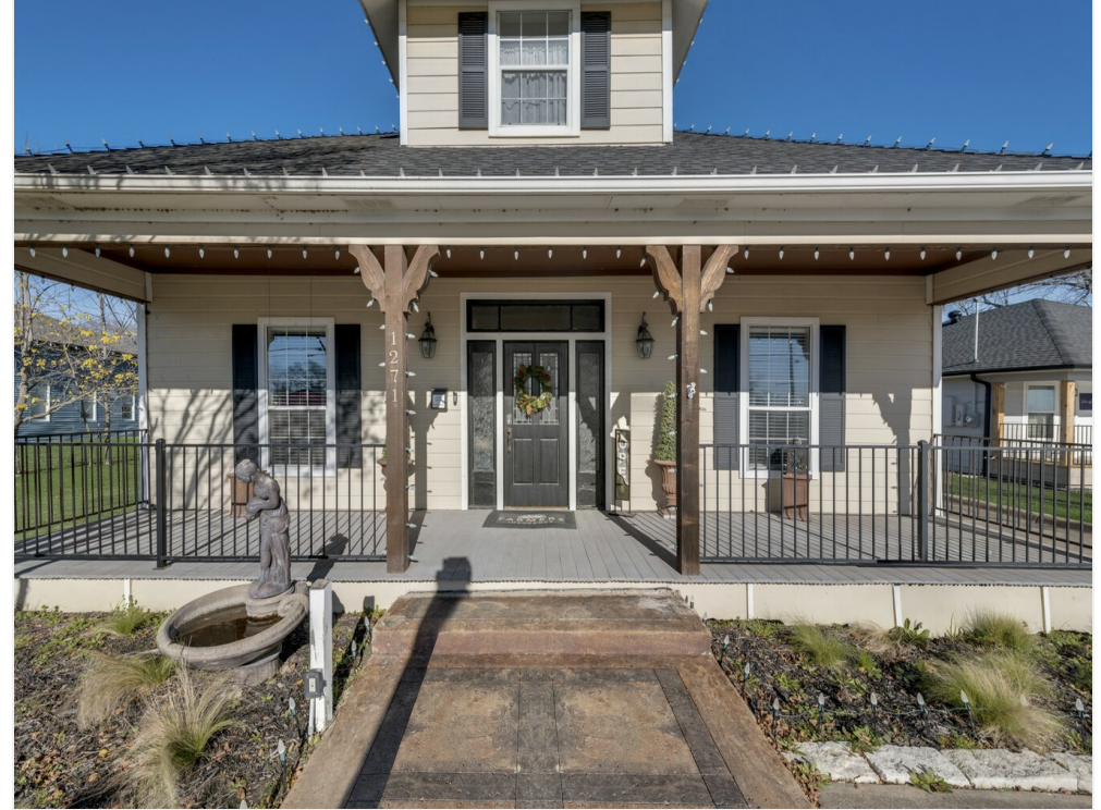
Front Country Porch