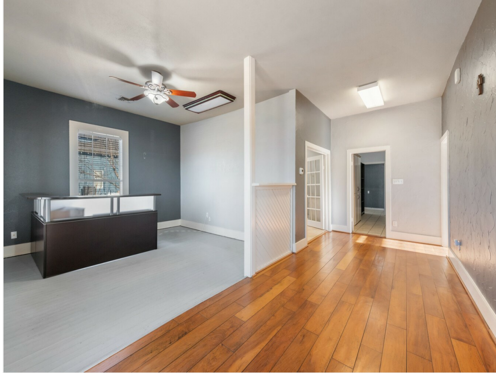
Entry & Reception