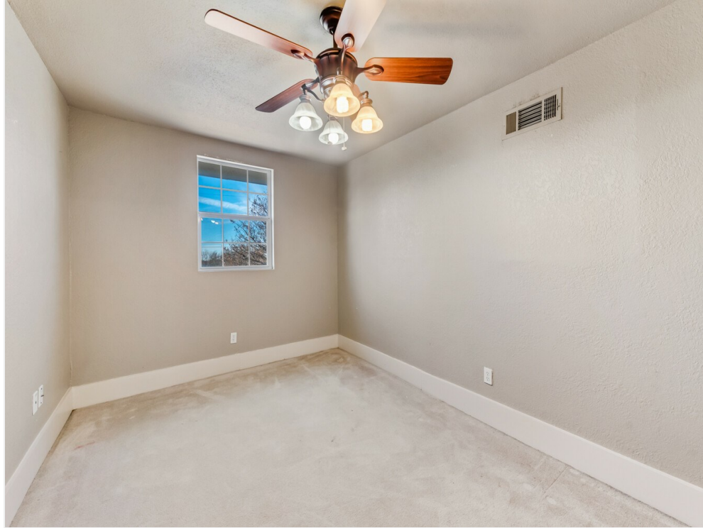
Private Office up