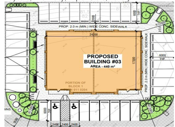
AIR RANCH COMMUNITY

Okotoks was one of the few communities its size to have its own airport. A number of small air shows were held there over the years. It was the home of an aircraft charter company, flight school, and a helicopter flying school. The site has now evolved into an airpark community called the Okotoks Air Ranch, where the property owners, if they wish, can build homes with attached hangars for their private planes. Otherwise, like other communities in the vicinity of Calgary, it is served by the Calgary International Airport.