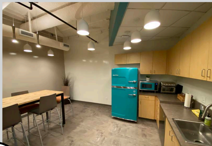
KITCHEN & BREAK AREA