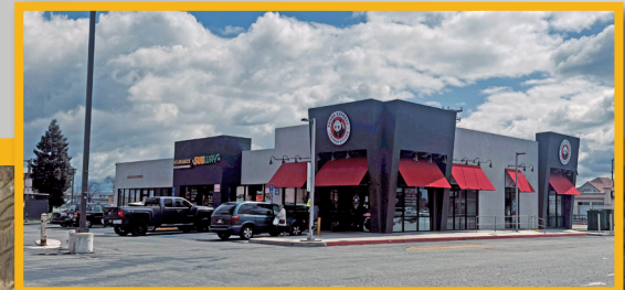
1400 Brundage Land - Suite 105

1400 Brundage Lane - Suite #105 Bakersfield, CA 93304