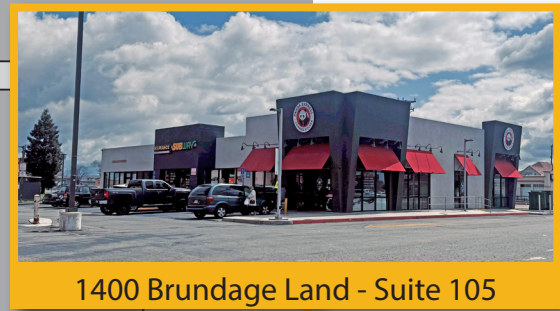
1400 Brundage Land - Suite 105