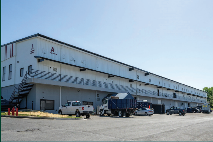
8701 - 8745 D'Arcy Road