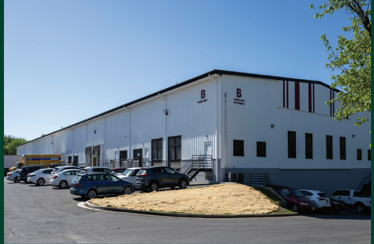
8755 - 8799 D'Arcy Road