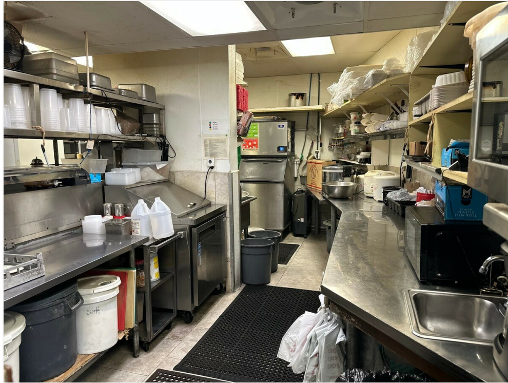
Kitchen Ready-to-Serve Prep Area