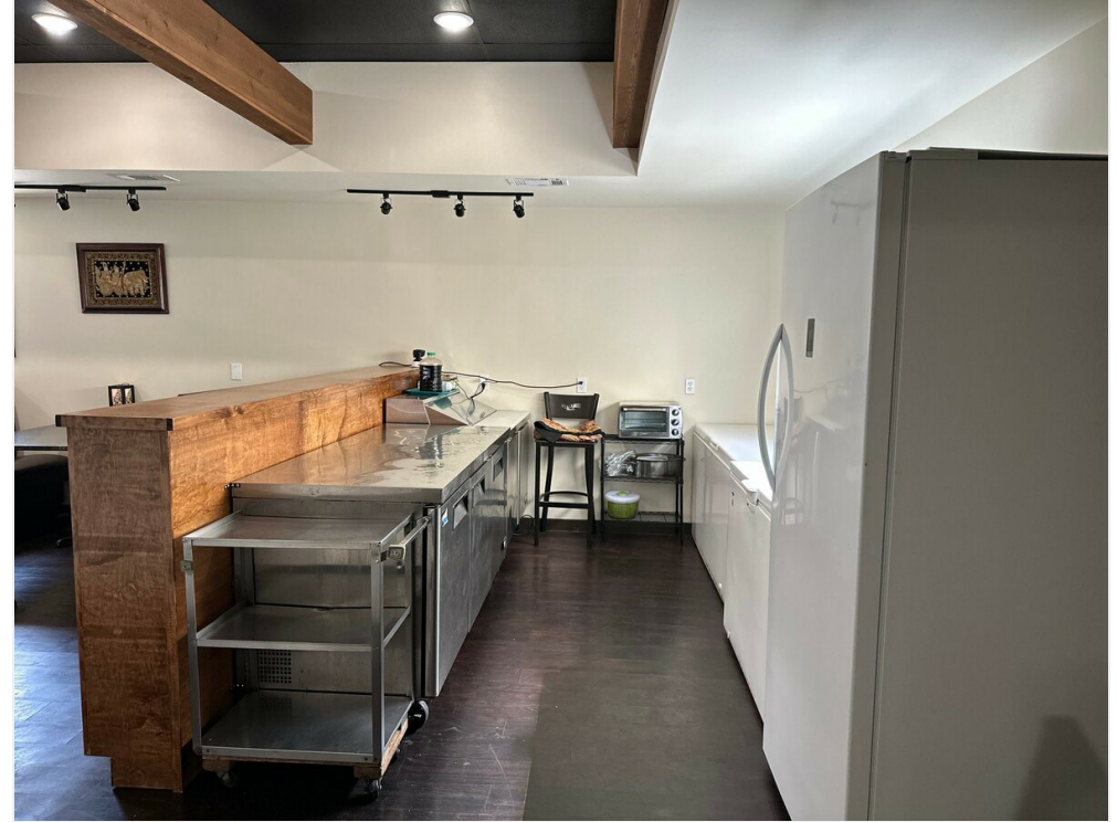
Food and Beverage Bar