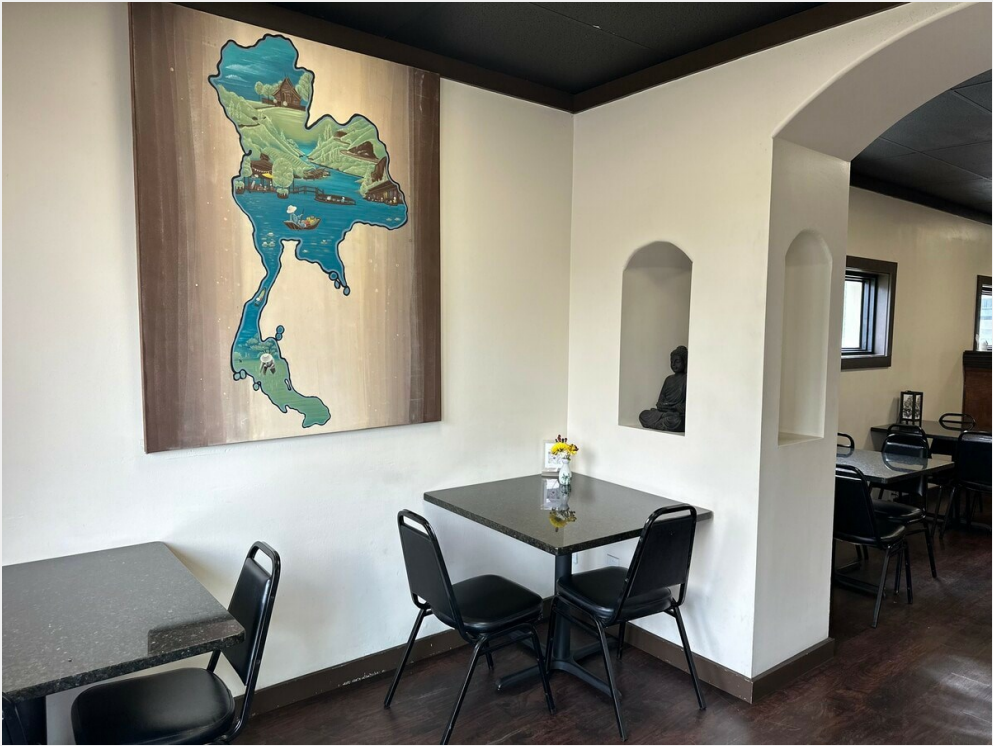
Front of the House