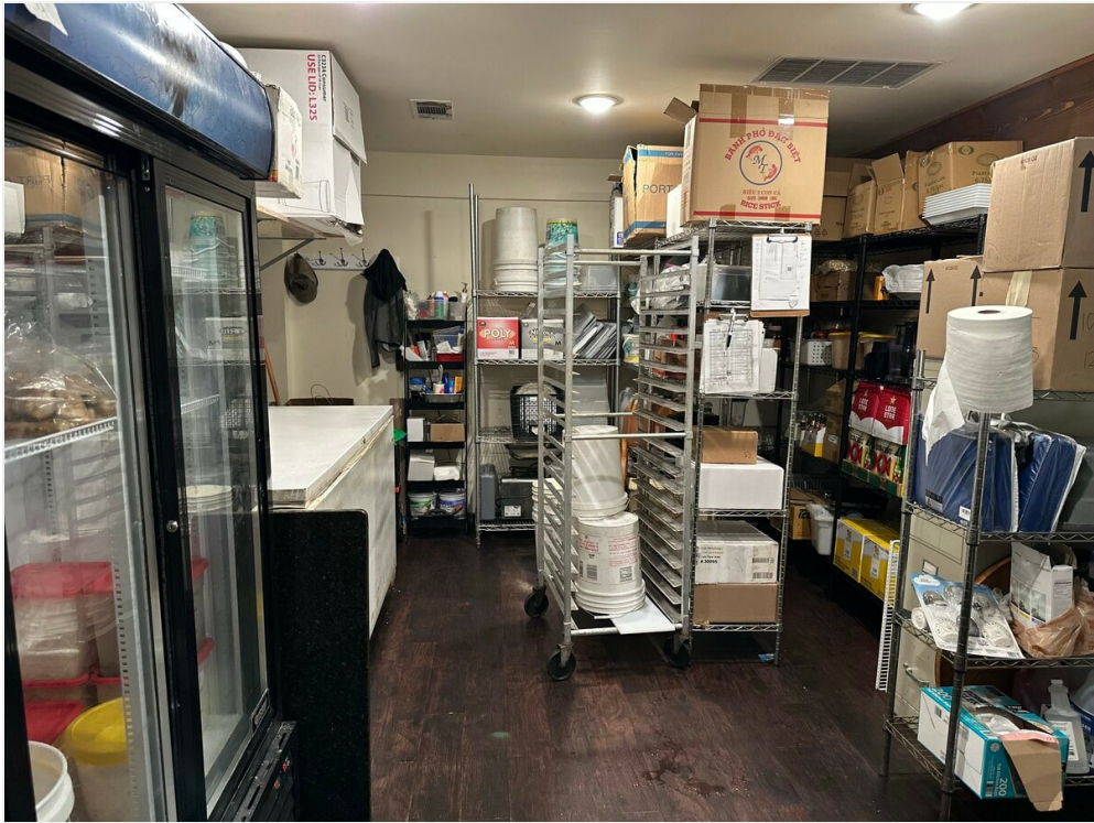
Storage Space Area