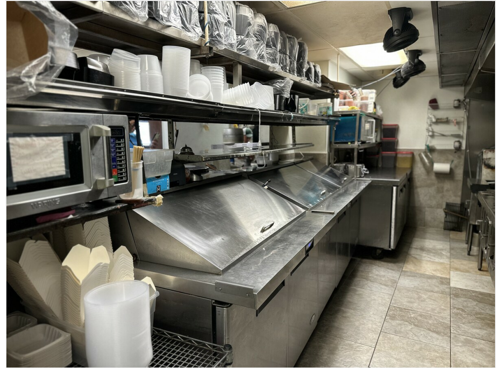
Kitchen Cooking Section