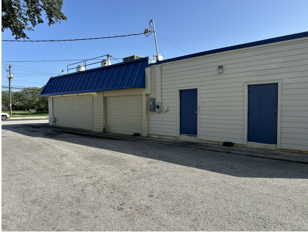
Side View of Staff Entry