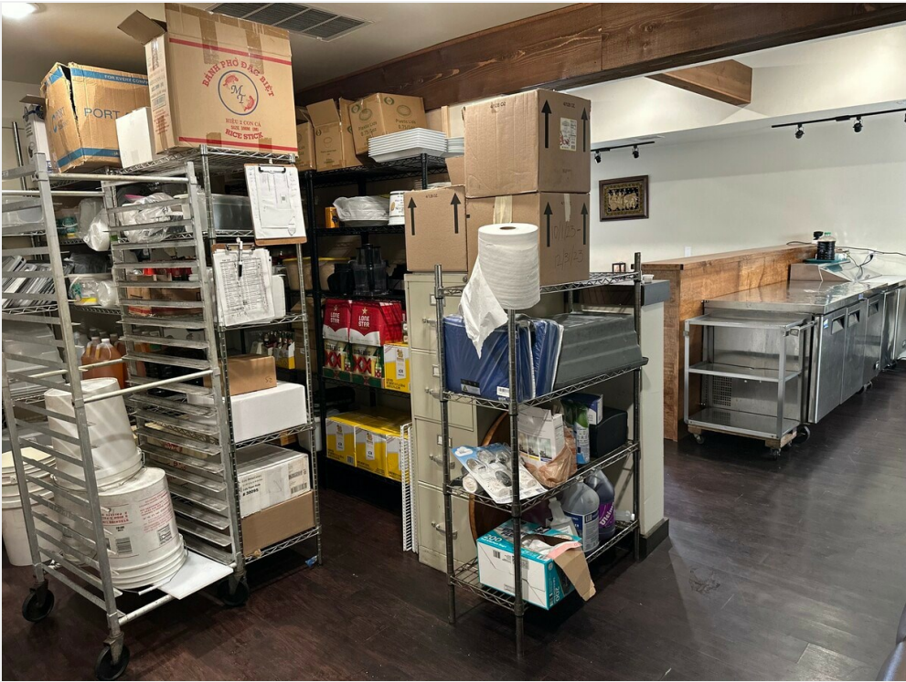
Storage Space Area