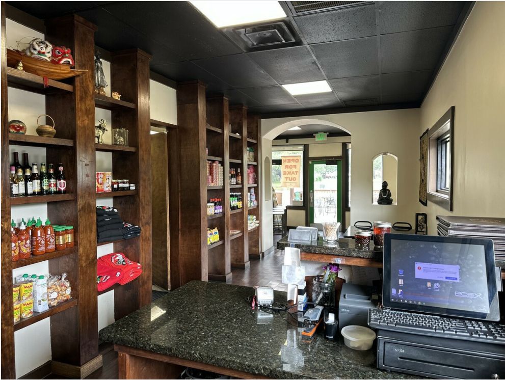
Front of the House