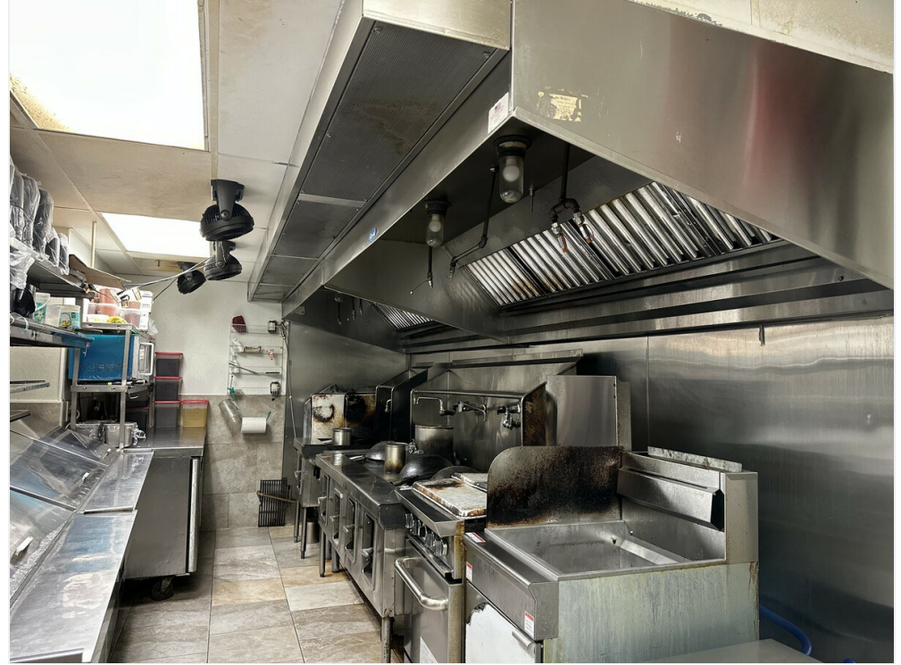
Vent Hood and Cooking Area