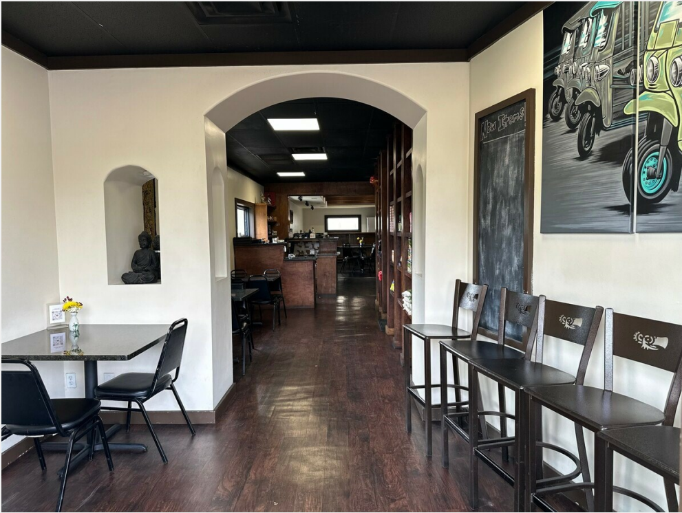
Front of the House