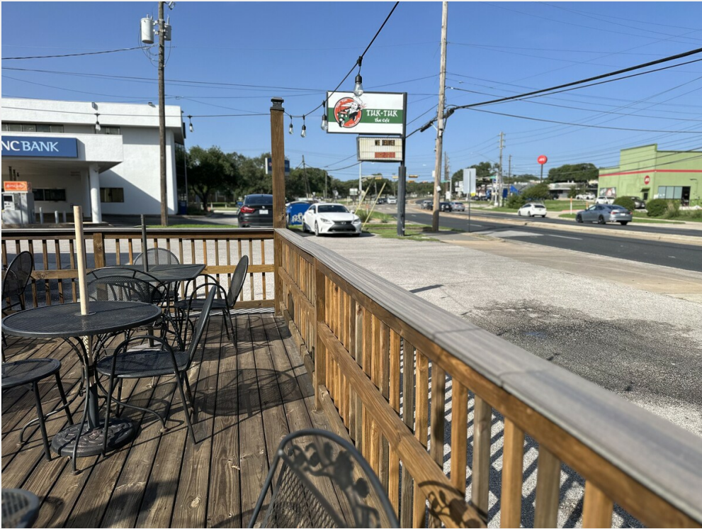
Frontage Patio View