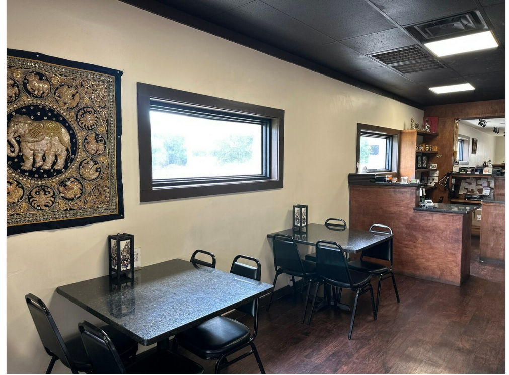
Front of the House