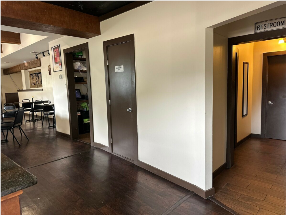
Front of the House