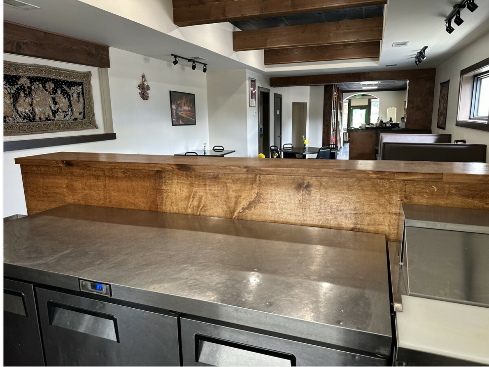
Food and Beverage Bar