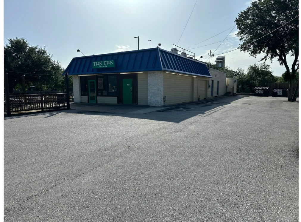
Frontage View & Parking Lot