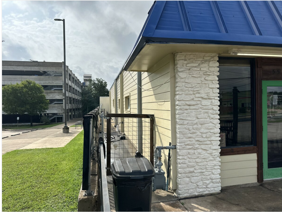
Property Line View