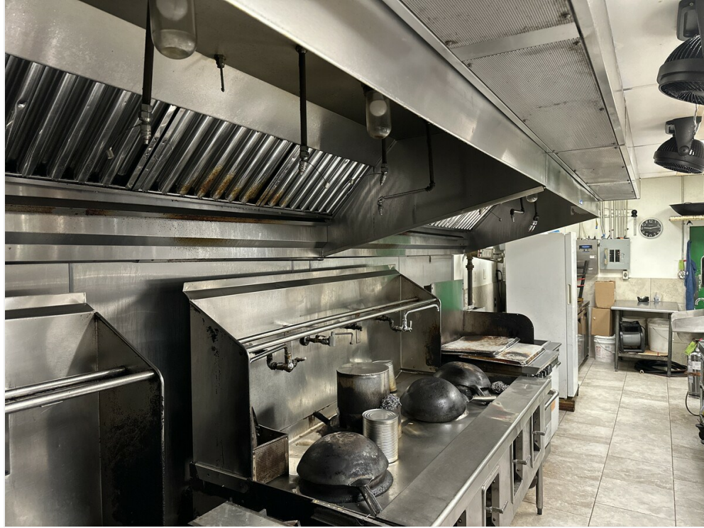
Vent Hood and Cooking Area