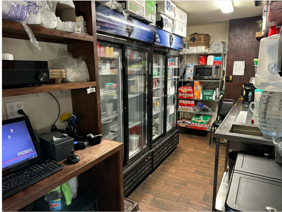
Beverage and Storage Area