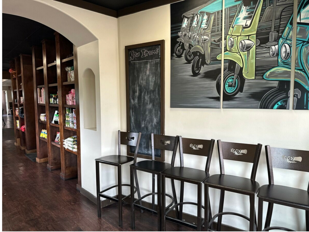
Front of the House