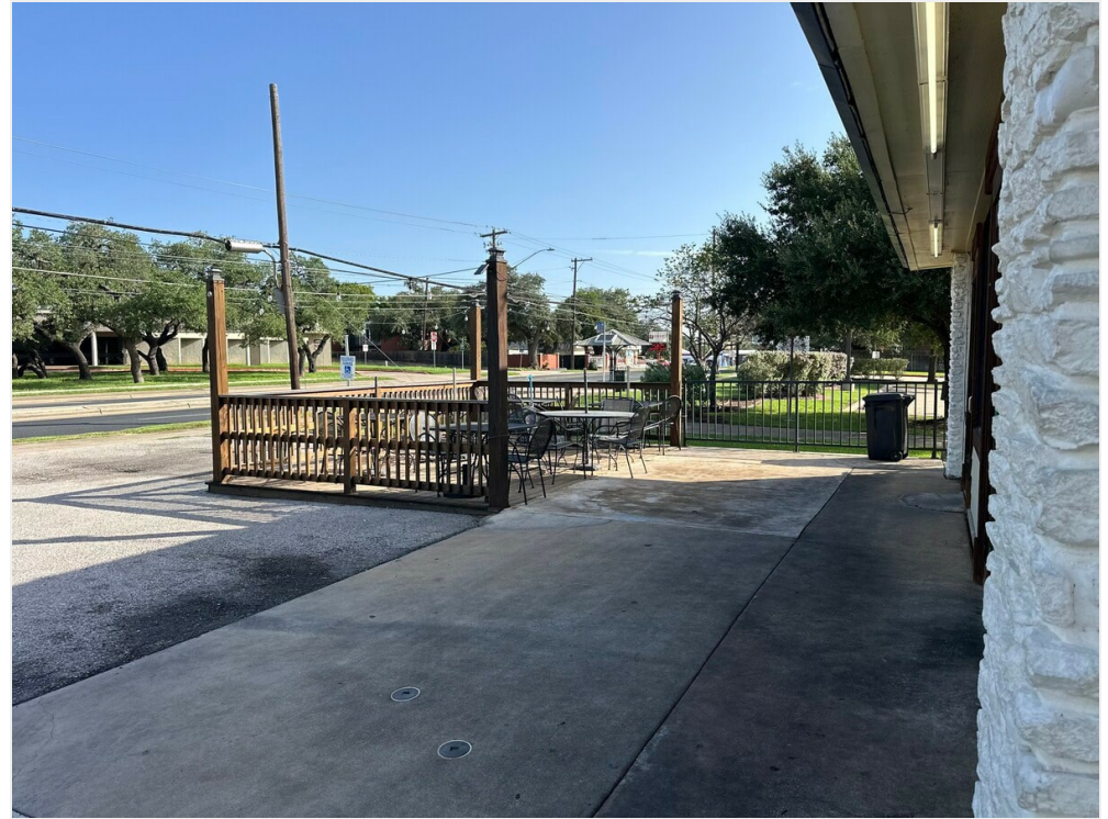
Frontage Patio Space