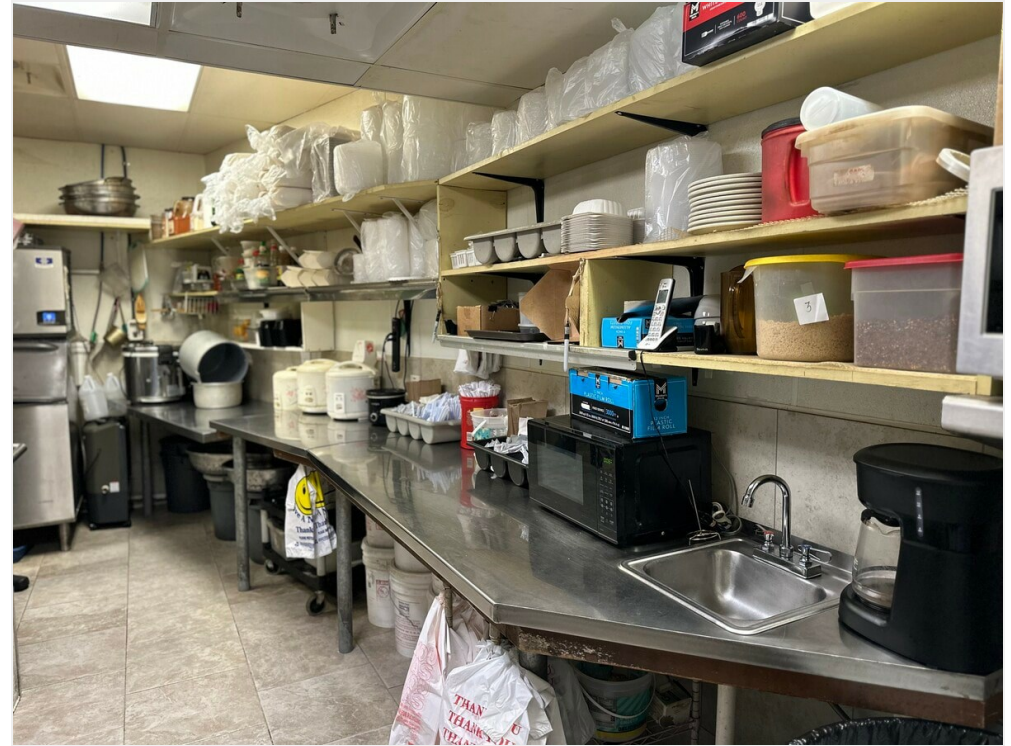
Kitchen Ready-to-Serve Prep Area