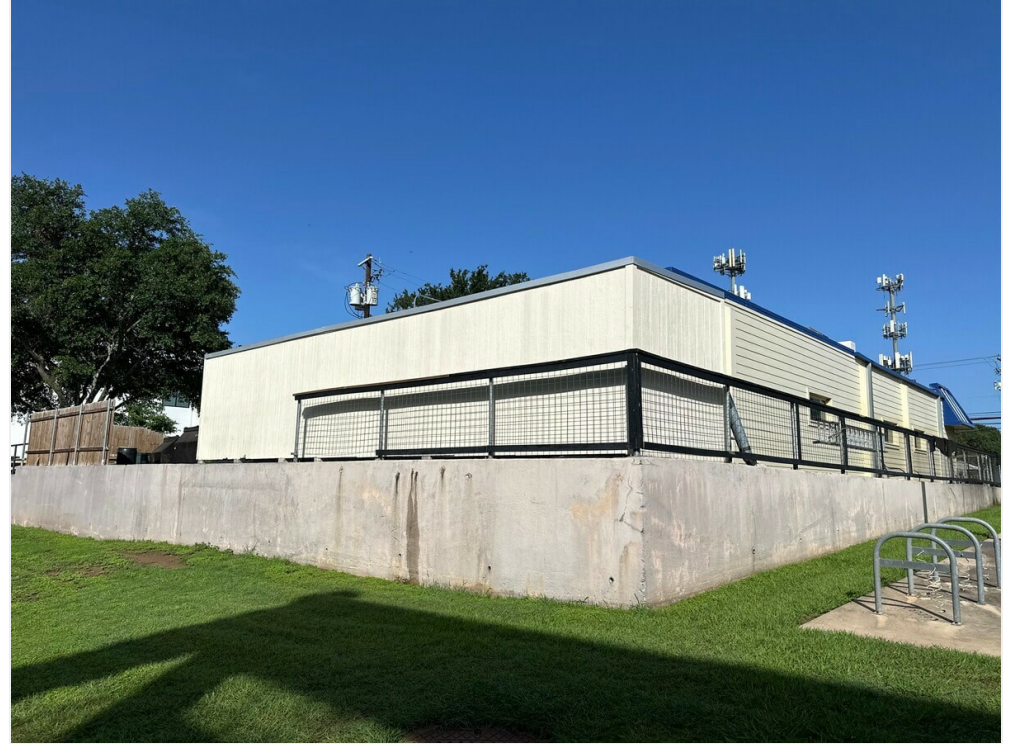
Property Line for the Rear