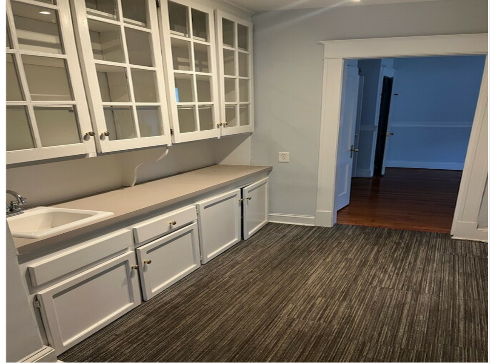
Kitchen / Workspace