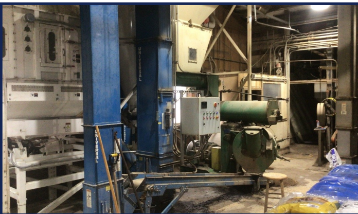
Pellet Machine Leg