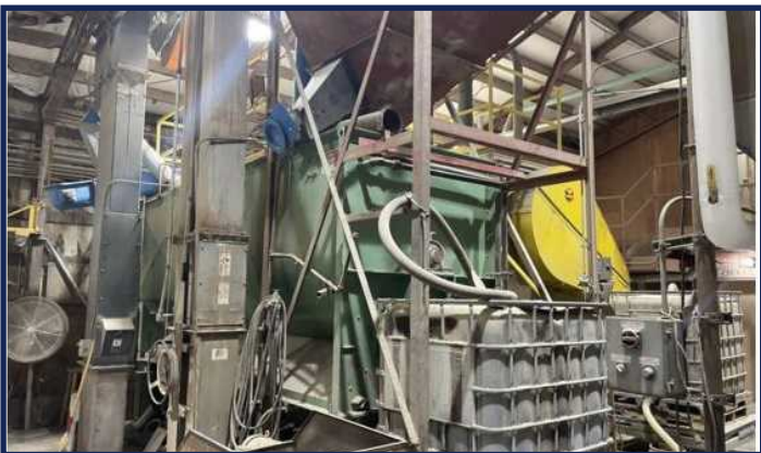
4-ton Scott Mixer