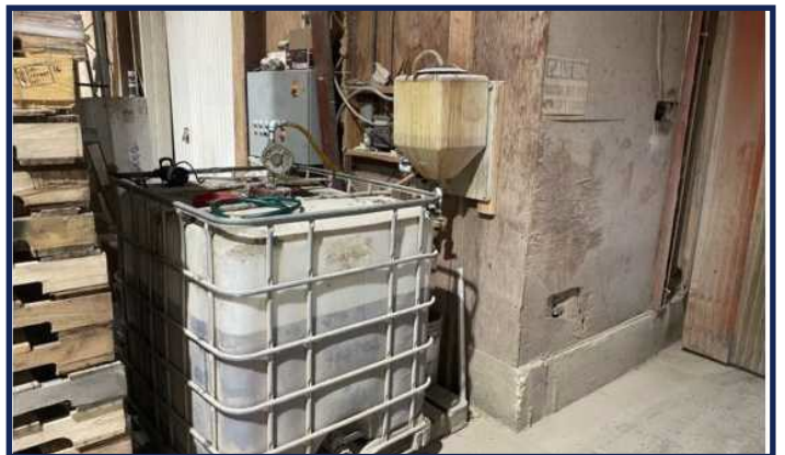
Oil Applicator Machine