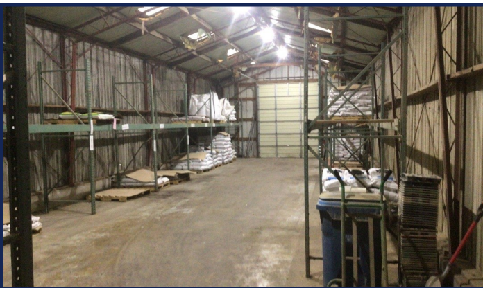
Warehouse with Loadout