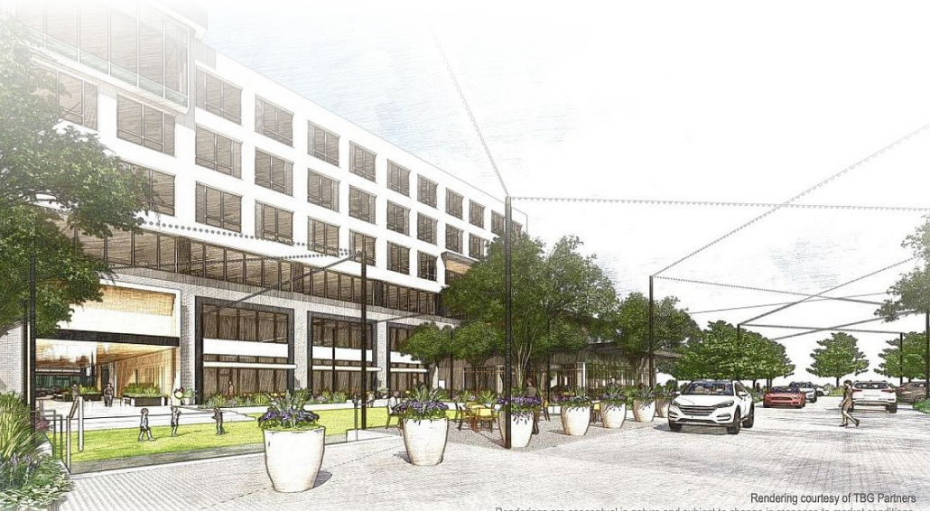
Renderings are conceptual in nature and subject to change in response to market conditions.