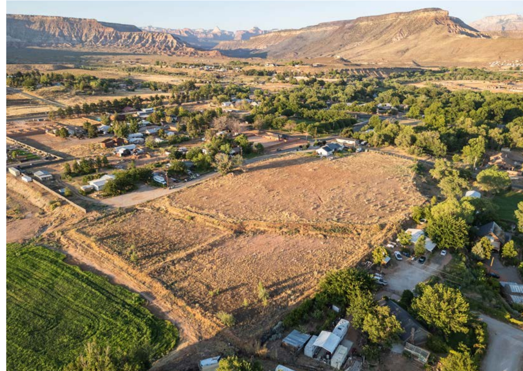
Offered By: Roy Barker