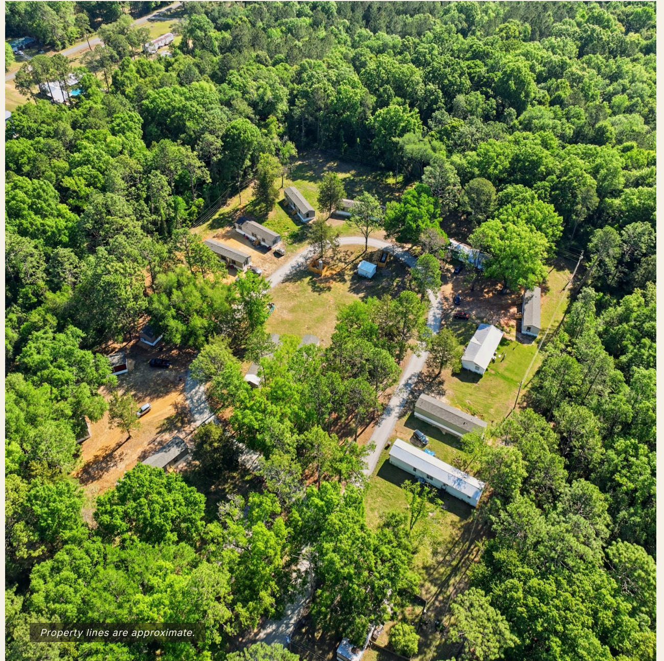
Property lines are approximate.