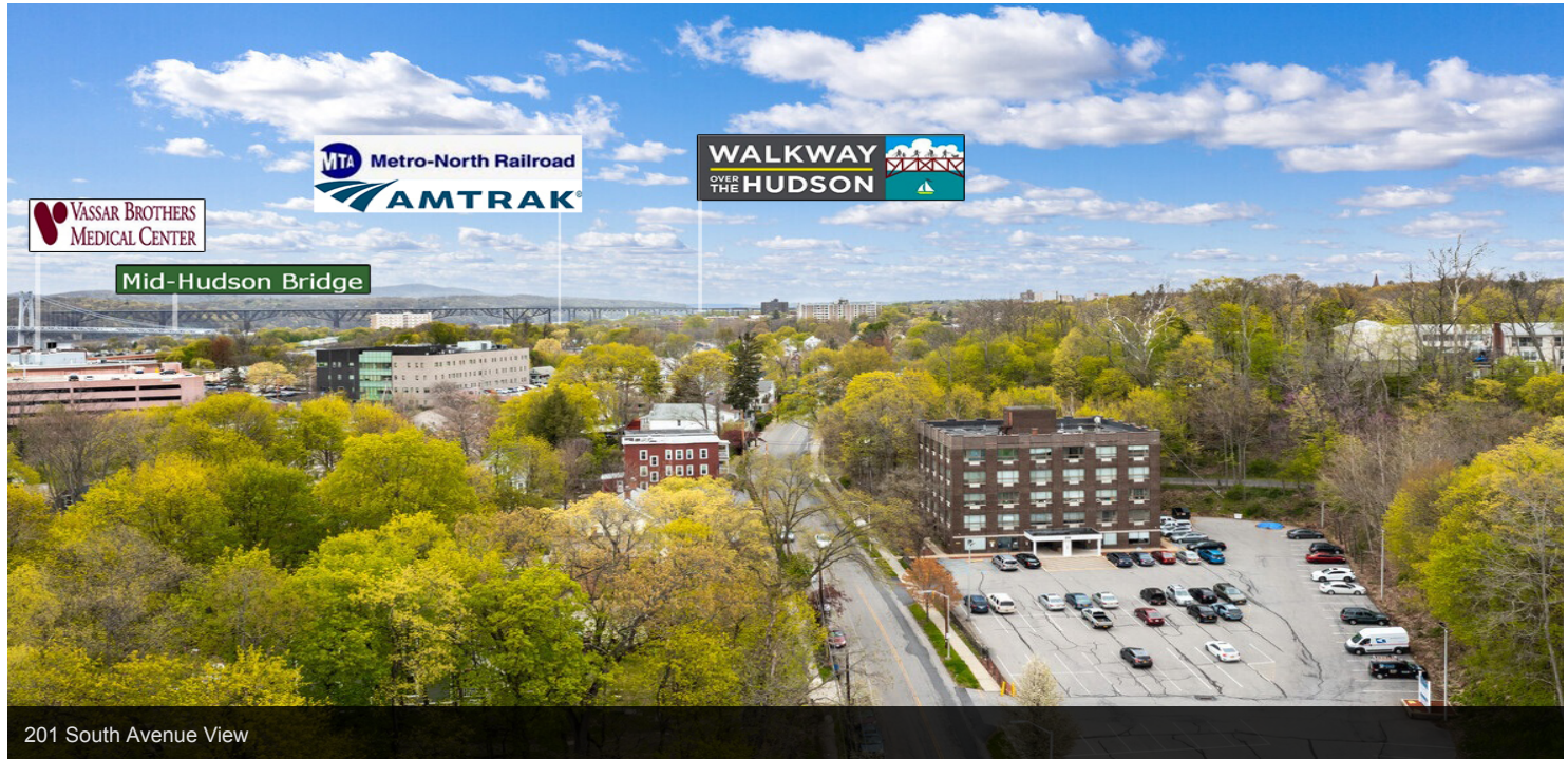
201 South Avenue View

MID HUDSON BRIDGE & U.S. ROUTE 9 - 4 MINUTES AWAY