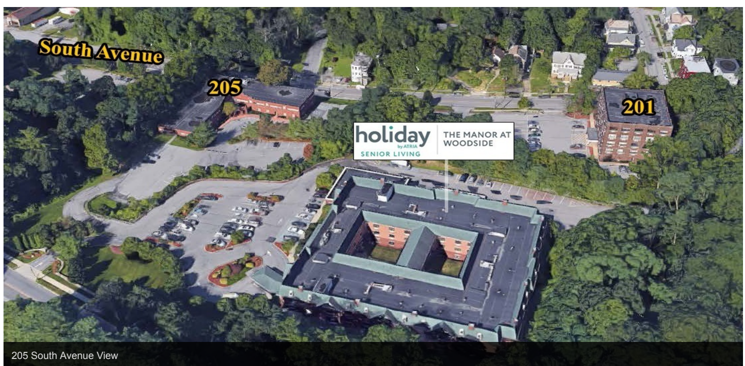
205 South Avenue View