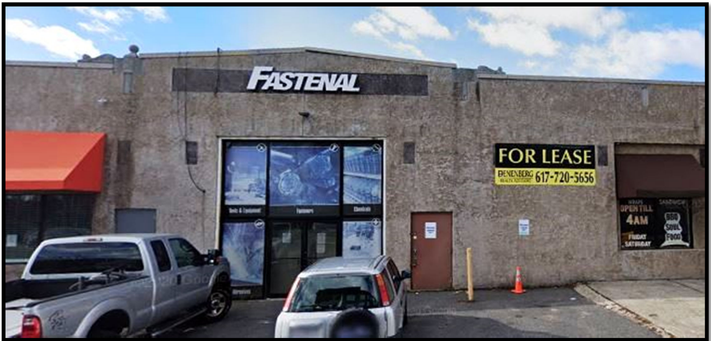
5,330 – 6,730 +/- SF – Center Inline Space (Fastenal Space)