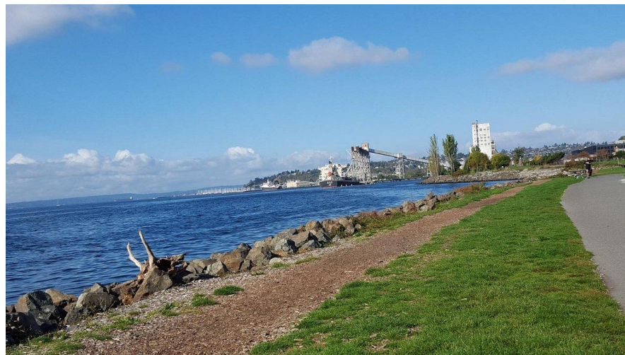
A view from Myrtle Edwards Park

Belltown seamlessly merges the past with the present, offering a unique urban experience that celebrates art, music, food, and a vibrant lifestyle. Whether you're strolling through its parks, enjoying live music, or savoring a meal, Belltown invites you to explore and enjoy all it has to offer.