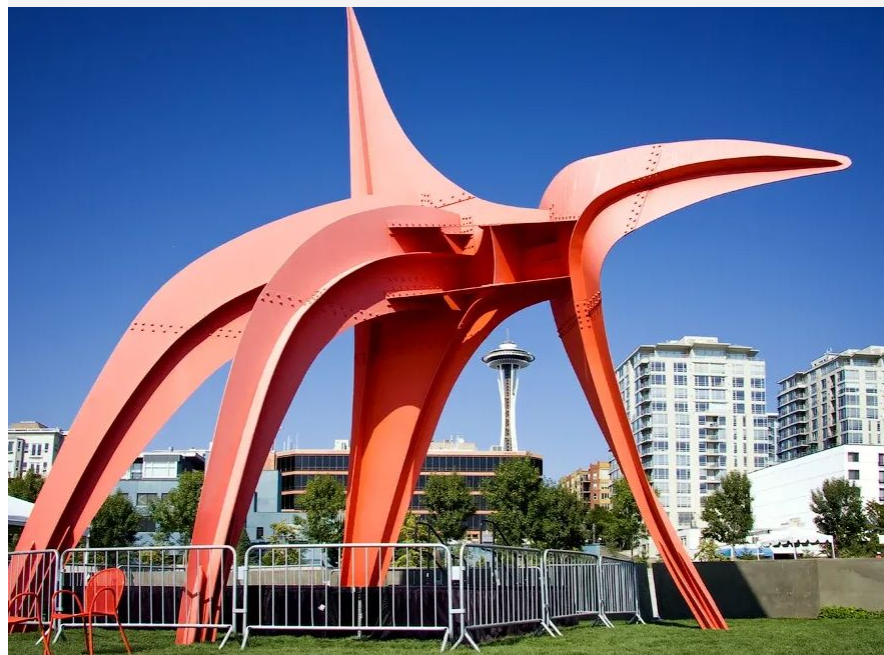
One of the sculptures from the Olympic Sculpture Park