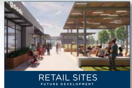
RETAIL SITES FUTURE DEVELOPMENT