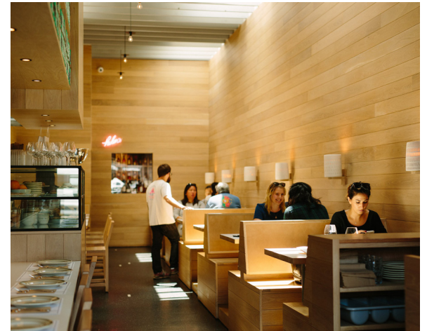
📍 JON & VINNYS - 412 N. FAIRFAX