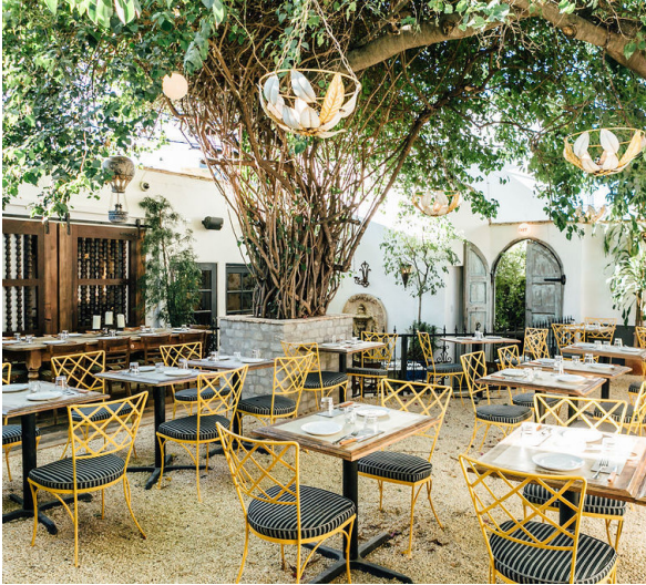
📍 BACARI RESTAURANT - 8030 W. 3RD ST

8075 W 3RD STREET, LOS ANGELES, CA 90048