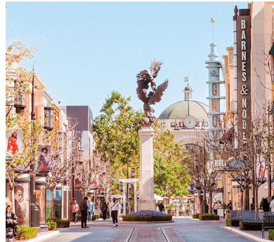
📍 THE GROVE - 6333 W. 3RD ST