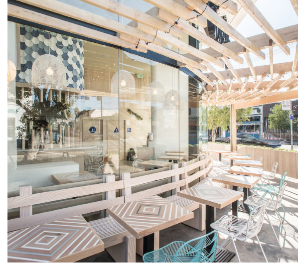
📍 SWEETFIN - 8075 W. 3RD ST