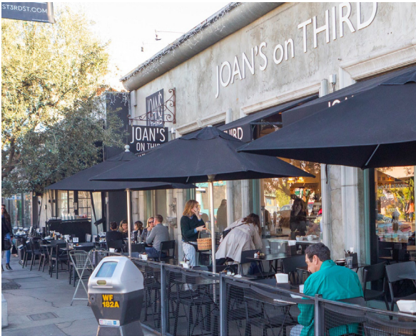
📍 JOAN'S ON THIRD - 8350 W. 3RD ST