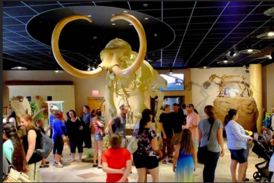
Arizona Museum of Natural History