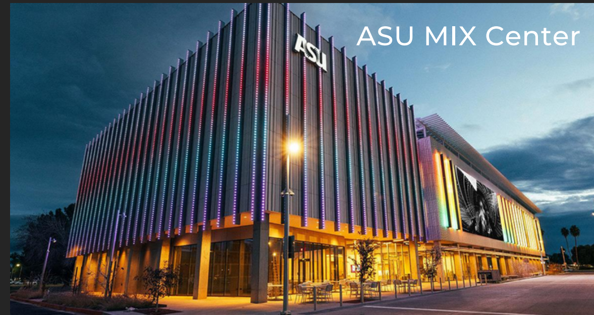
Downtown Mesa Community