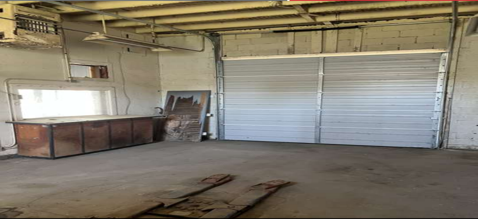
Front- West Shop Bay