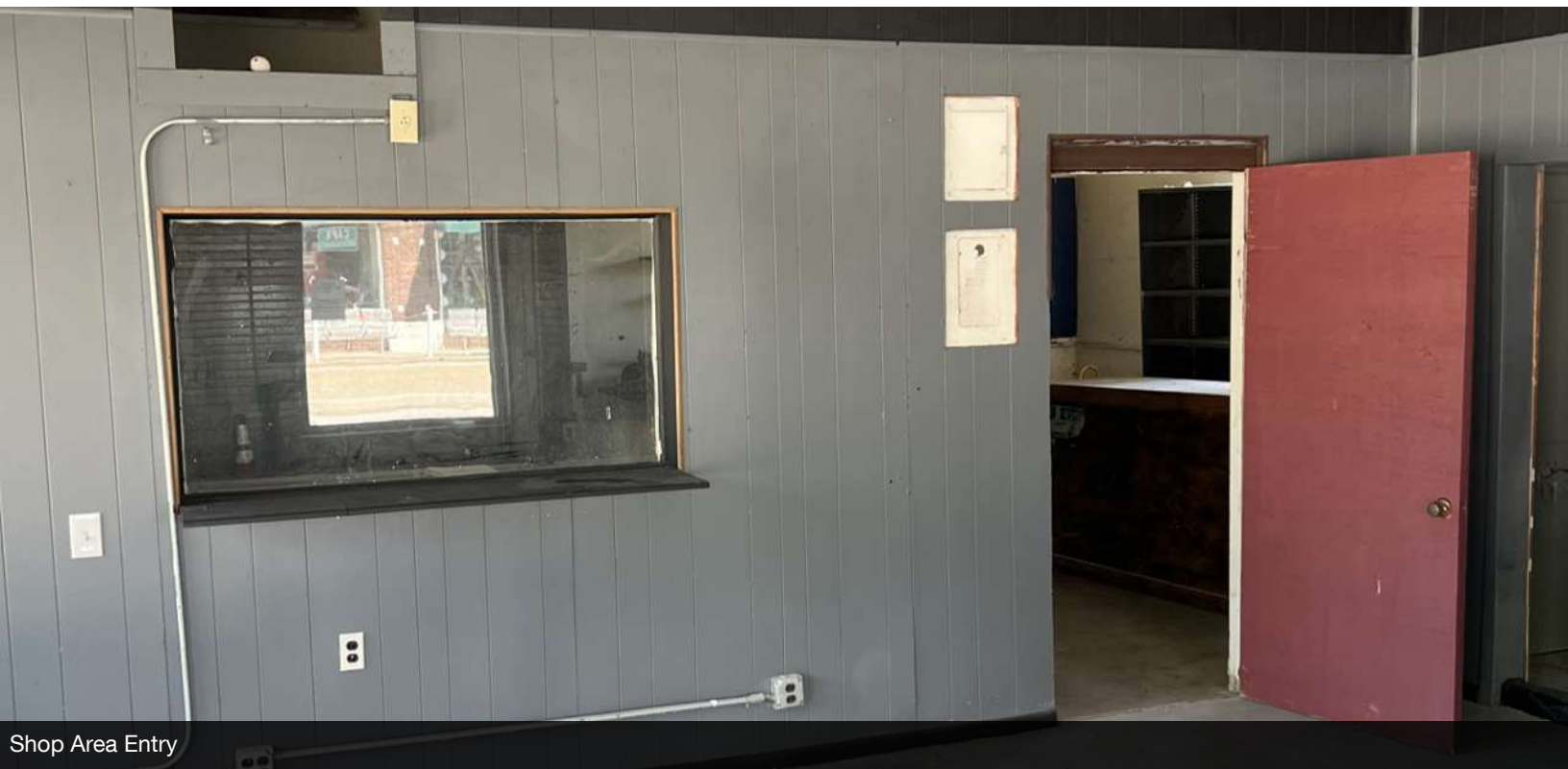
Shop Area Entry

We obtained the information above from sources we believe to be reliable. However, we have not verified its accuracy and make no guarantee, warranty or representation about it. It is submitted subject to the possibility of errors, omissions, change of price, rental or other conditions, prior sale, lease or financing, or withdrawal without notice. We include projections, opinions, assumptions or estimates for example only, and they may not represent current or future performance of the property. You and your tax and legal advisors should conduct your own investigation of the property and transaction.