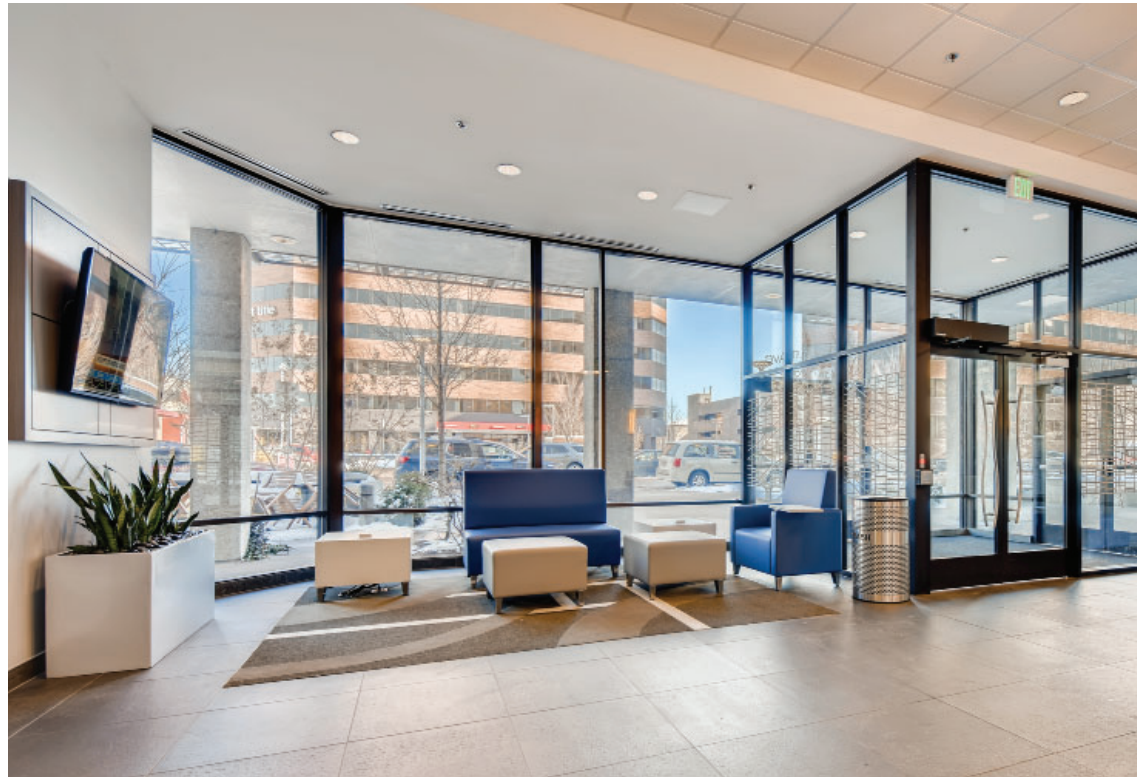
RECENTLY RENOVATED LOBBY AND COMMON AREAS