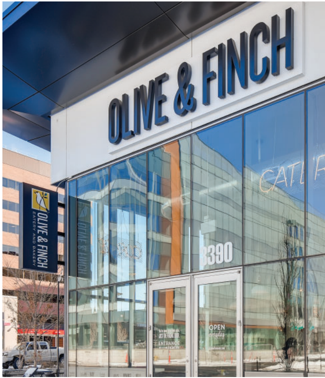
GRAB BREAKFAST AND COFFEE OR ENJOY A PATIO LUNCH AT OLIVE & FINCH ON-SITE