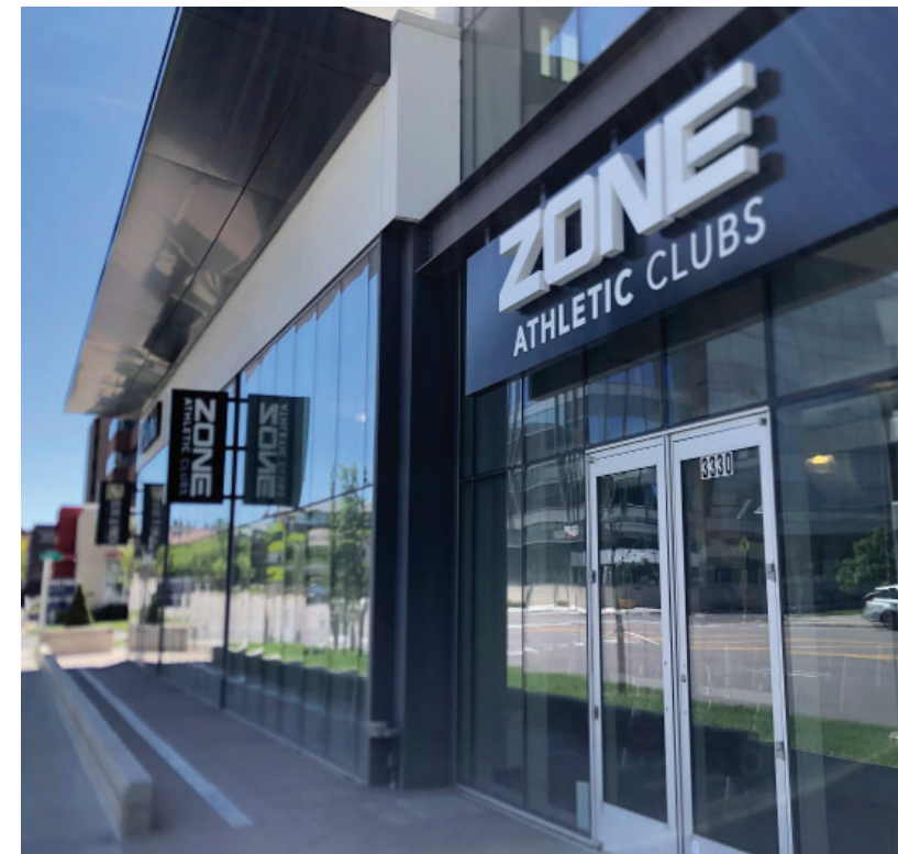
SWEAT SESSION ON DEMAND AT ZONE FITNESS' ON-SITE LOCATION