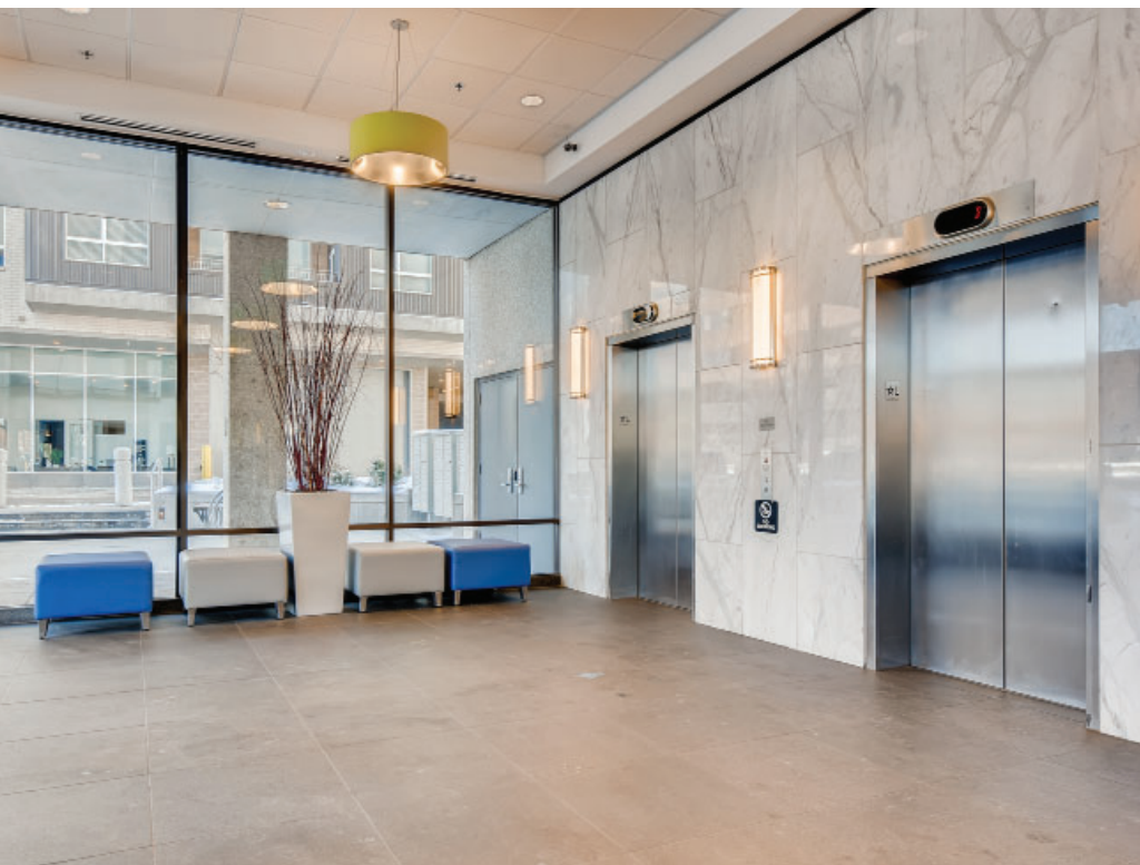
MODERN, CLASS A FINISHES THROUGHOUT