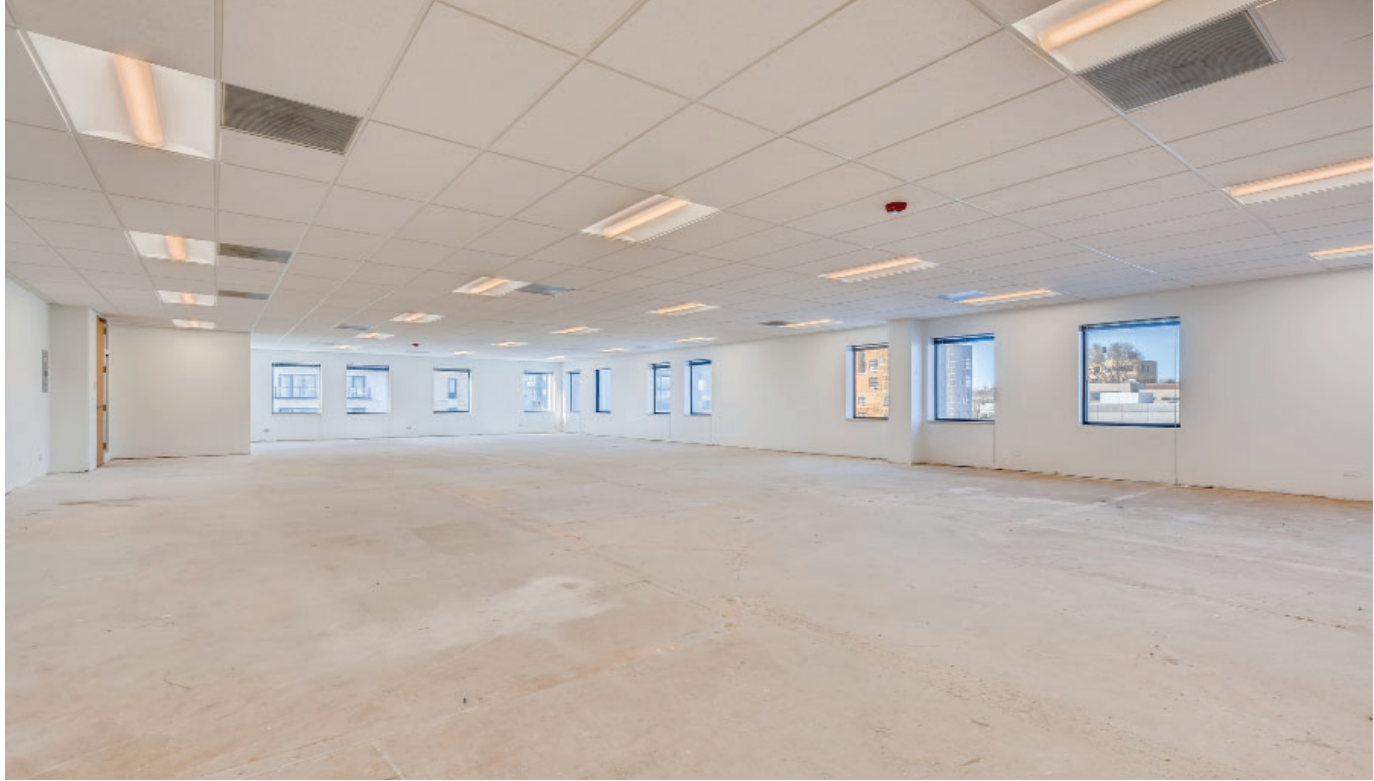
WHITE BOX SPACE READY FOR YOUR MARK