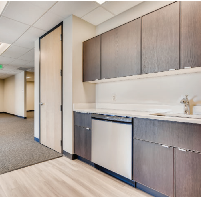
MOVE-IN READY SPEC SUITES

Address: 3300 E 1st Avenue | Denver, Colorado RBA: 93,306 square feet Floors: Six (6) Parking ratio: 2.0:1,000