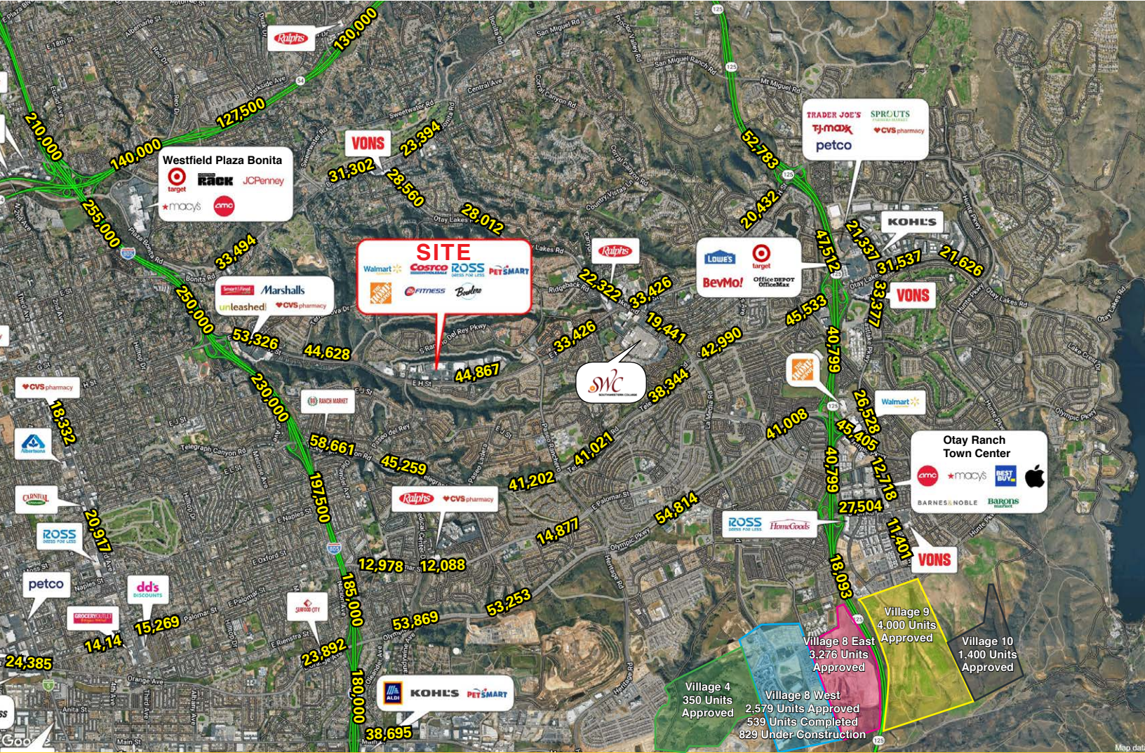
2024 City of Chula Vista Traffic Counts