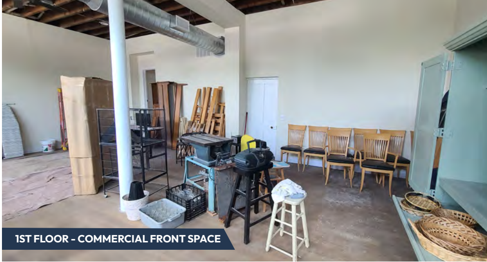
1ST FLOOR - COMMERCIAL FRONT SPACE