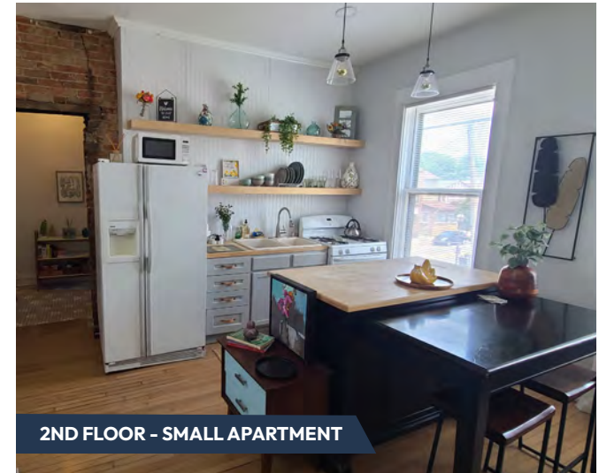
2ND FLOOR - SMALL APARTMENT