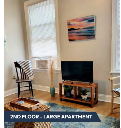
2ND FLOOR - LARGE APARTMENT