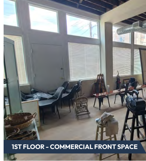
1ST FLOOR - COMMERCIAL FRONT SPACE