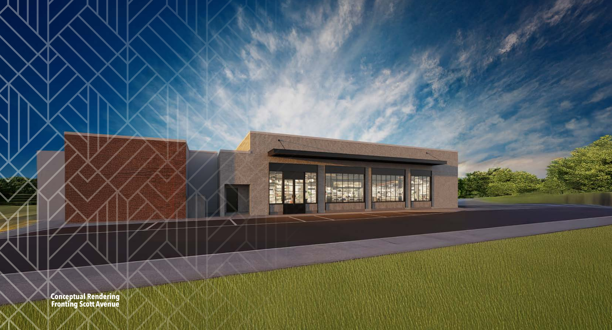
Conceptual Rendering Fronting Scott Avenue